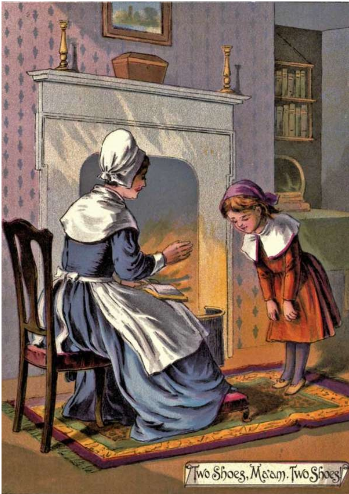
Two Shoes, Ma'am. Two Shoes.

Little Margery had seen how good and wise Mr. Smith was, and thought it was because of his great learning; and she wanted, above all things, to learn to read. At last she made up her mind to ask Mr. Smith to teach her when he had a moment to spare. He readily agreed to do this, and Margery read to him an hour every day, and spent much time with her books.