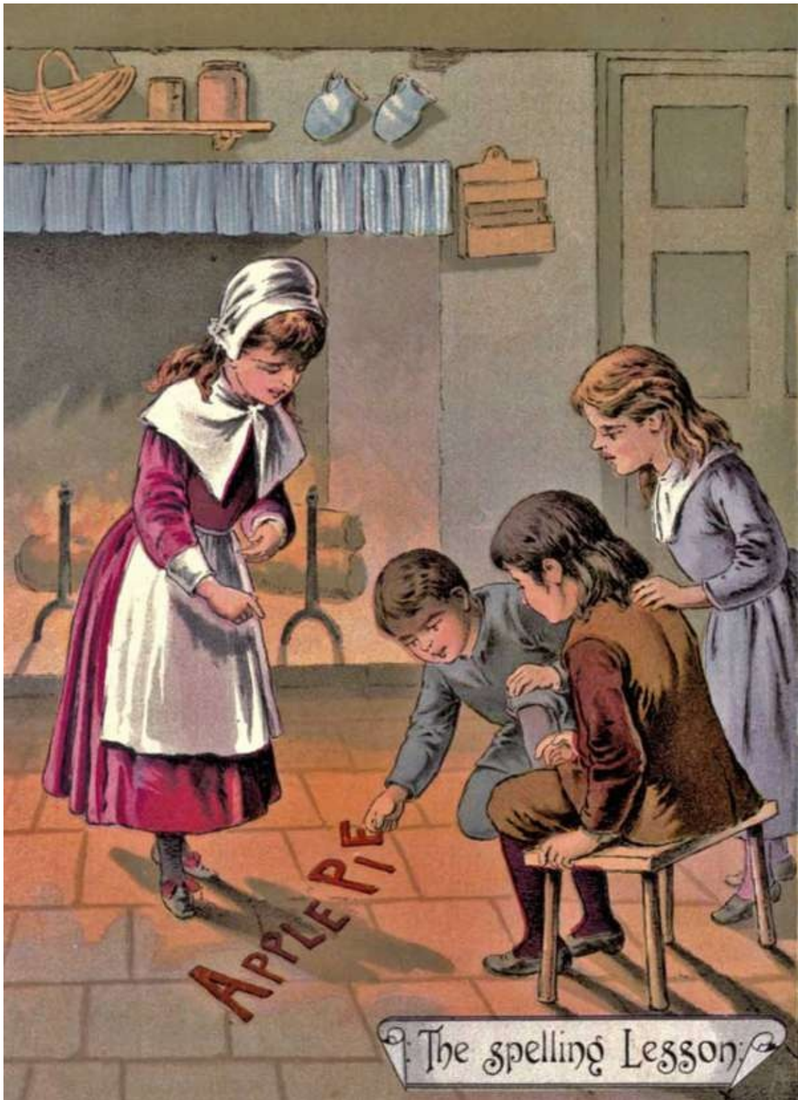
The spelling Lesson

She had not been there long before she heard footsteps, and three men came into the barn for shelter. The hay was piled up between her and them, so that they could not see her, and, thinking they were alone, they spoke quite loudly.