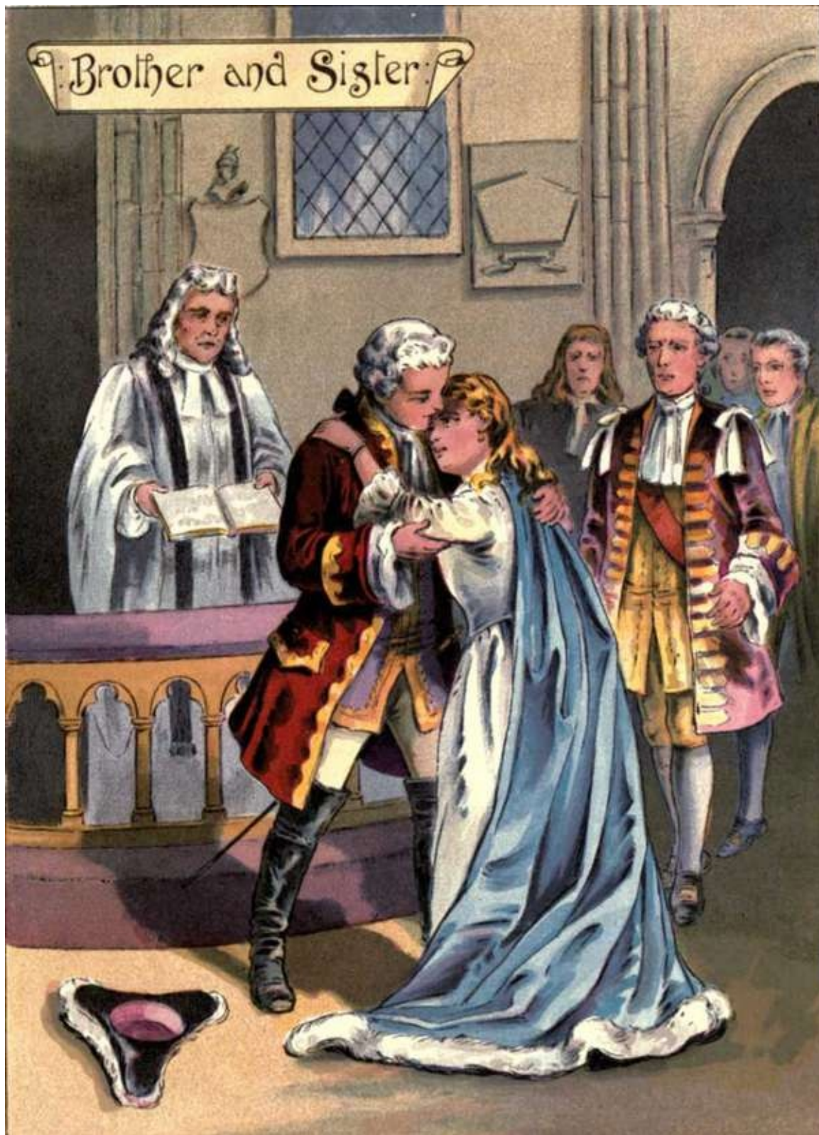
Brother and Sister

This being known to Sir William Dove, he asked Mrs. Williams to examine Goody Two Shoes and see if she was not clever enough for the office. This was done, and Mrs. Williams reported that little Margery was the best scholar, and had the best heart of any one she had ever examined. All the country had a great opinion of Mrs. Williams, and this report made them think highly of Miss MARGERY, as we must now call her.