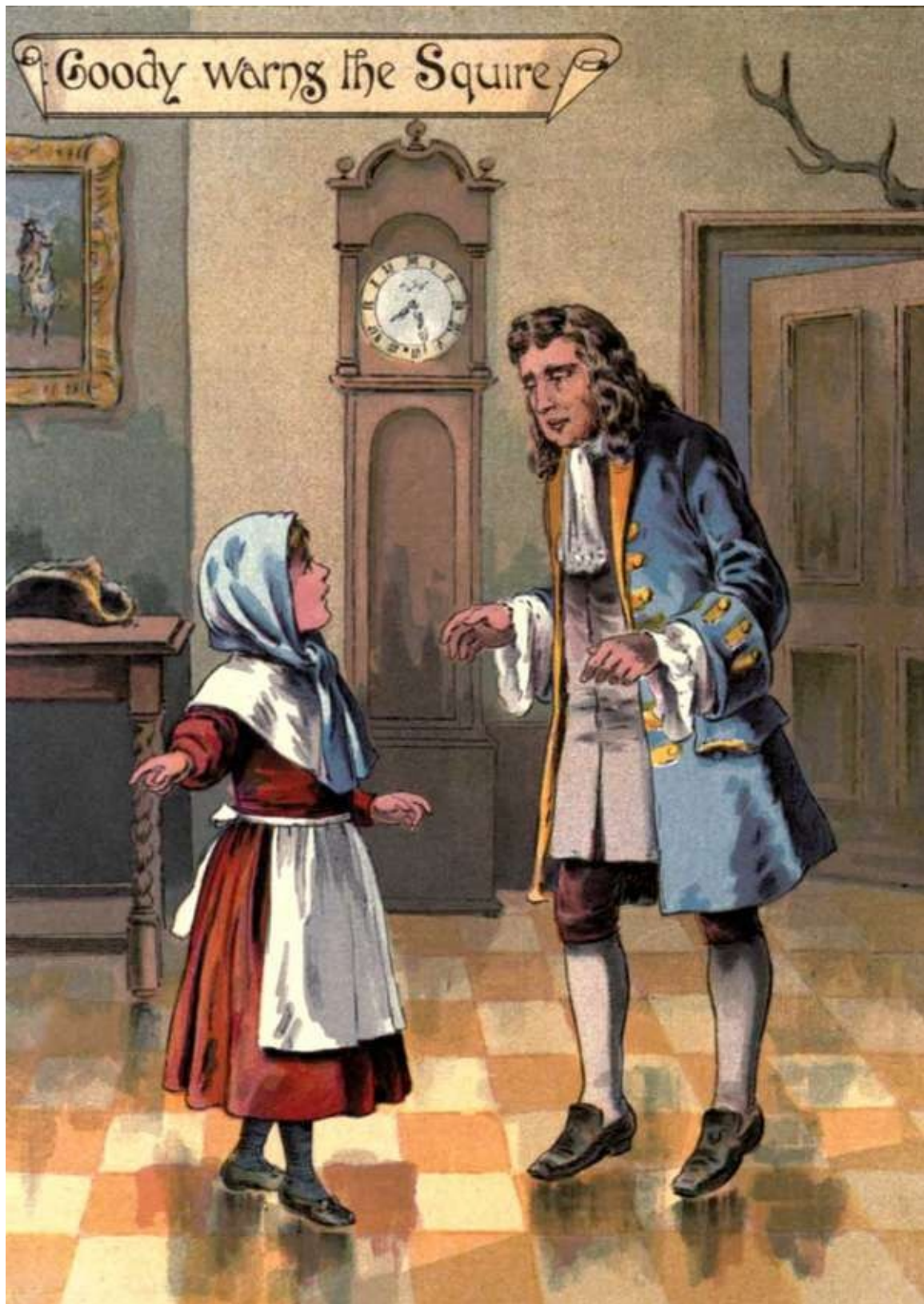
Goody warns the Squire

Mrs. Williams, who lived in Margery's village, kept school, and taught little ones their A B C's. She was now old and feeble, and wanted to give up this important trust.