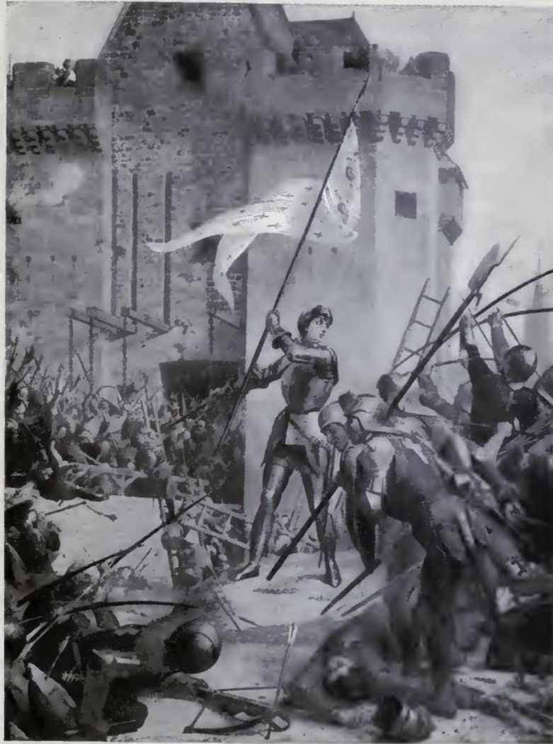
THE SIEGE OF ORLEANS (From the painting by J. E. Lenepveu in the Panthéon at Paris)

THE TROOPS must have a rest. Two days would be allowed for this. The morning of the 14th I was writing from Joan's dictation in a small