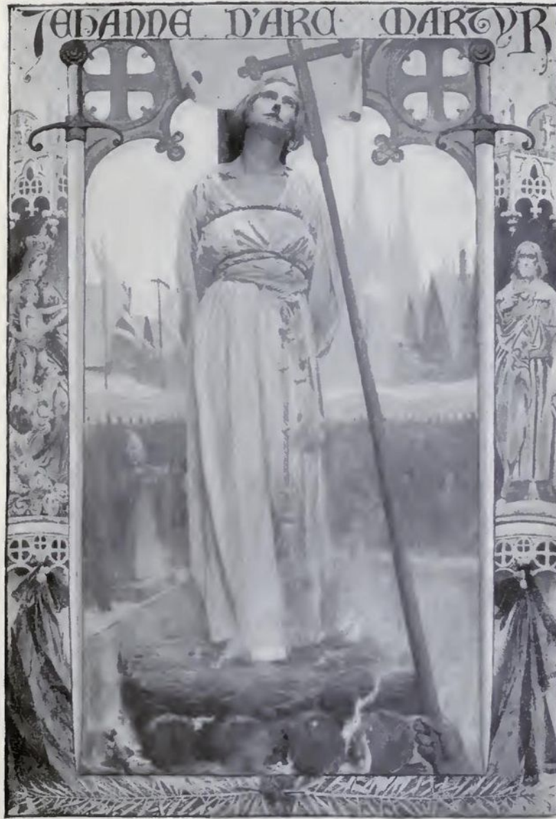
THE MARTYRDOM OF THE MAID OF ORLEANS