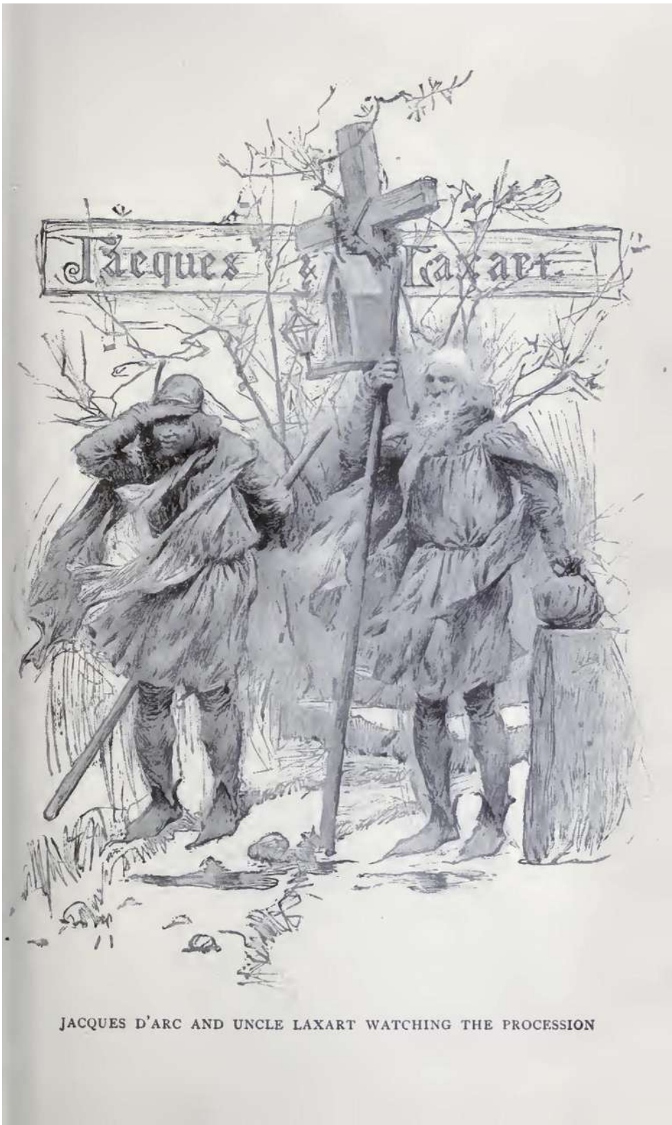
JACQUES D'ARC AND UNCLE LAXART WATCHING THE PROCESSION