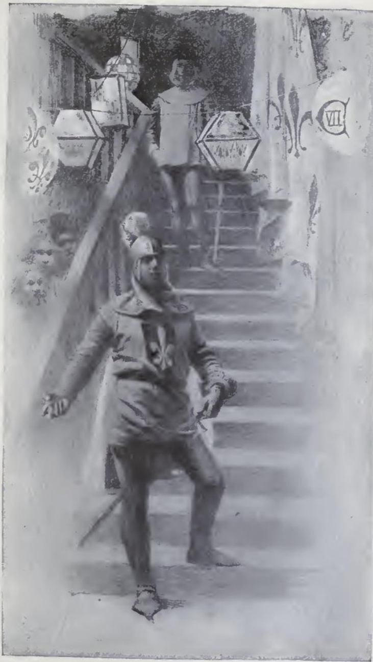
THE PALADIN TELLS HOW HE WON PATAY