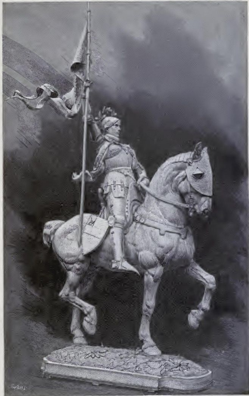
THE MAID OF ORLEANS (From a statue by Fremiet in the Rue de Rivoli at Paris)