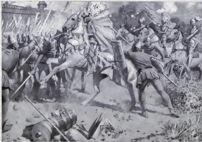
THE CAPTURE OF JOAN OF ARC AT COMPIÈGNE

ON TUESDAY, the 20th of February, while I sat at my master's work in the evening, he came in, looking sad, and said it had been decided to begin the trial at eight o'clock the next morning, and I must get ready to assist him.