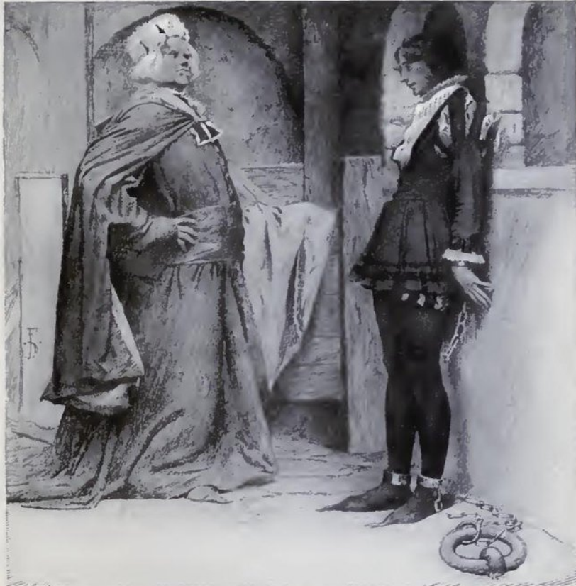
CAUCHON ACCUSES JOAN OF VIOLATING HER OATH