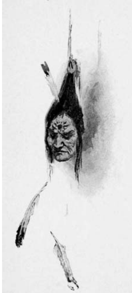
“THE HEAD OF THE BRAVE WATTAWAMAT.”