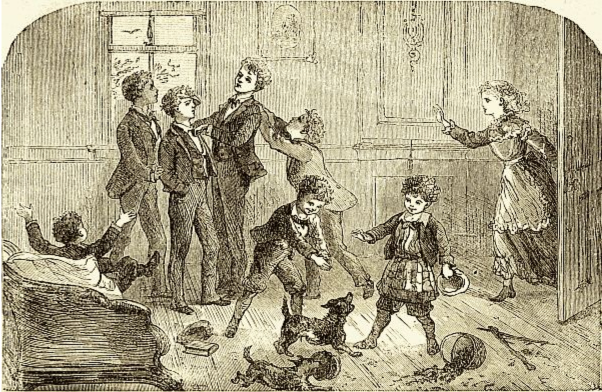
"THE SPECTACLE THAT MET NURSE ROSE'S EYE WAS A TRYING ONE."— PAGE 131

Now Rose considered this her special kingdom, and came down upon the invaders with an energy which amazed them and quelled the riot at once. They had never seen her roused before, and the effect was tremendous; also comical, for she drove the whole flock of boys out of the room like an indignant little hen defending her brood. They all went as meekly as sheep; the small lads fled from the house precipitately, but the three elder ones only retired to the next room, and remained there hoping for a chance to explain and apologize, and so appease the irate young lady, who had suddenly turned the tables and clattered them about their ears.