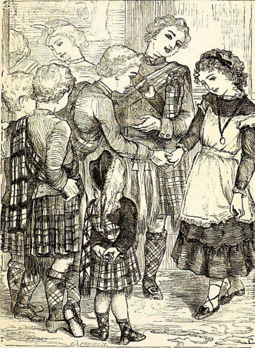
THE EIGHT COUSINS.—