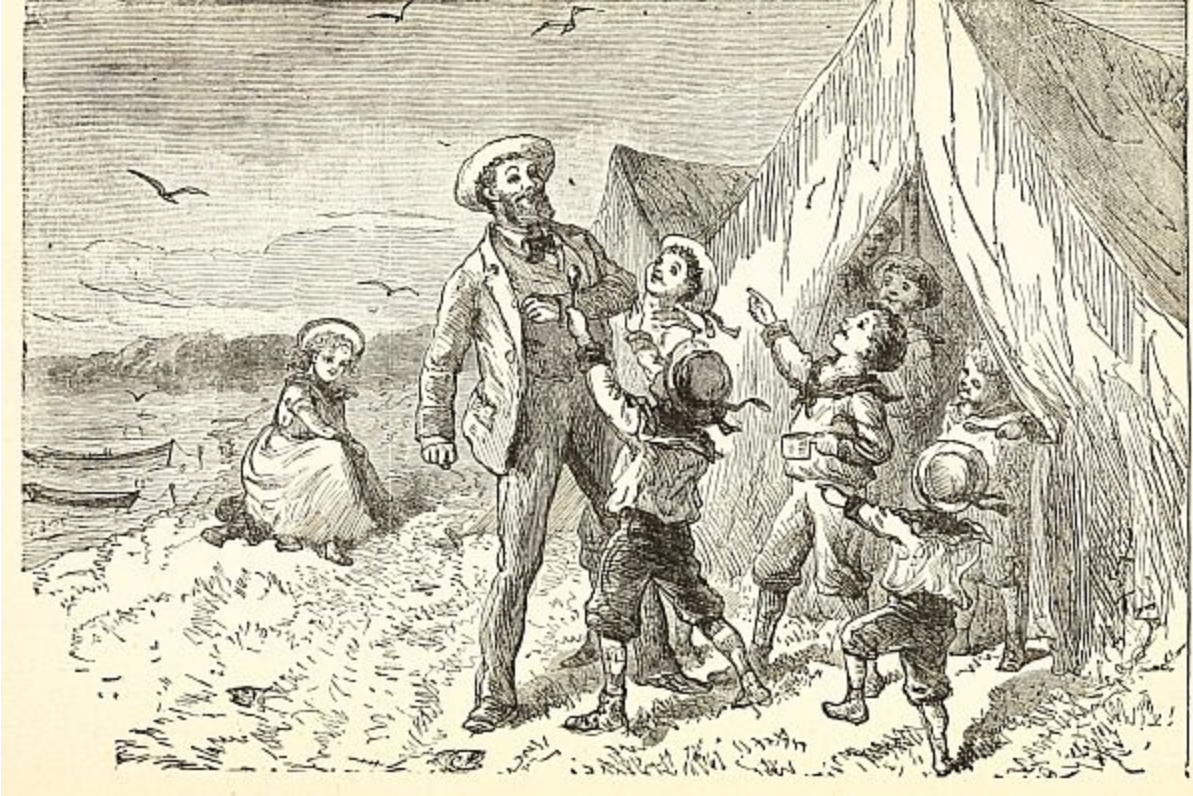
A CRASH, A SHOUT, A LAUGH, AND OUT CAME THE SAVAGES.— PAGE 99 .

"As this seat is rather damp, I think I'll rise," said Rose, as the excitement lessened a little.