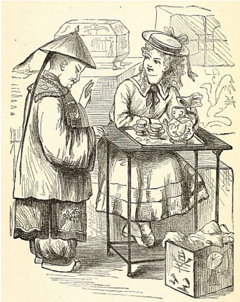
FUN SIGNIFIED IN PANTOMIME