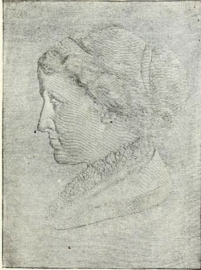
WALTON RICKETSON, SCULP.