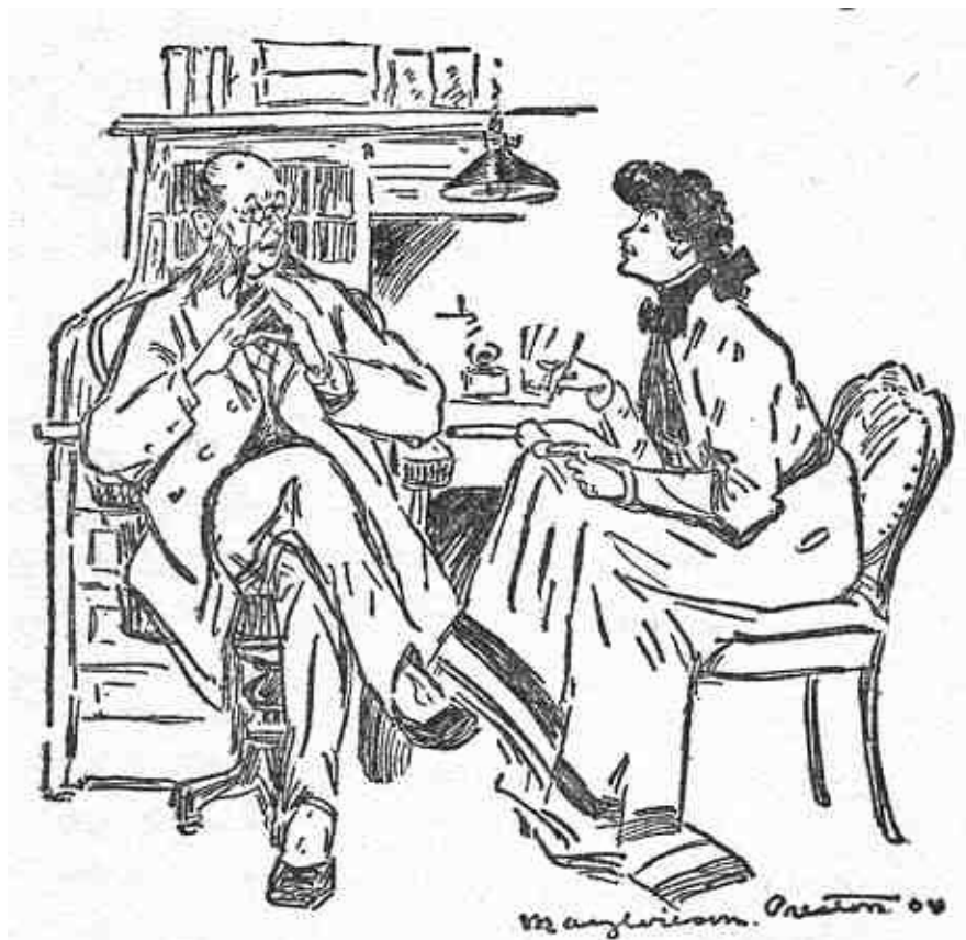
Busy in the main office room dictating letters to a shorthand countess.

There is a bookkeeper and an assistant, and a general atmosphere of varnish and culpability.