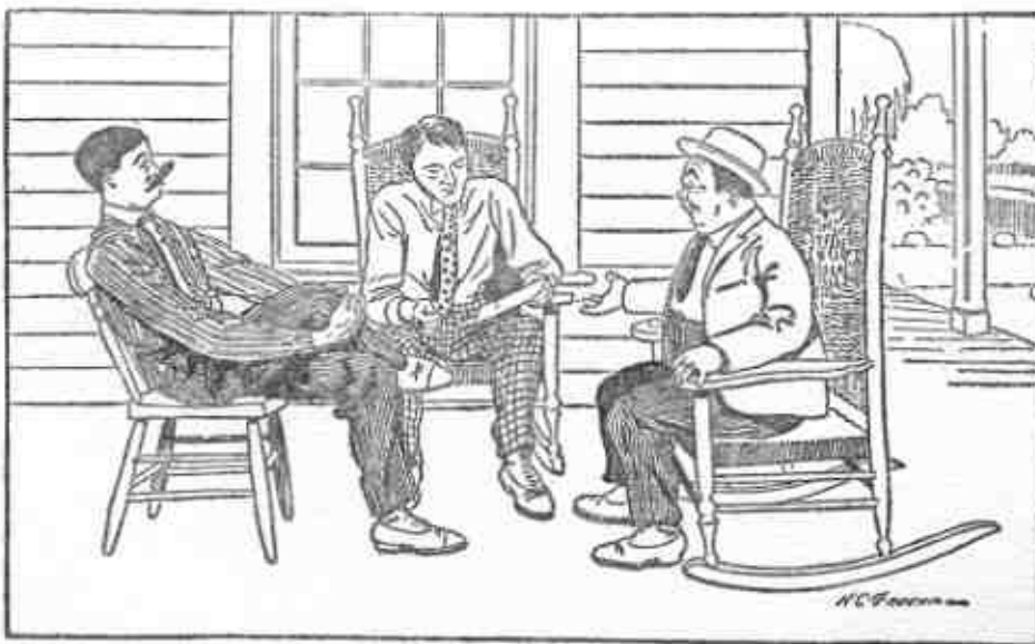
“Think of ‘em sending a letter like that to ME!’”