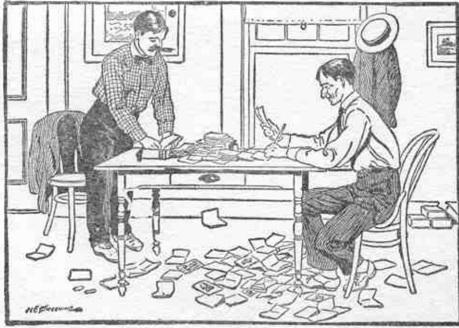
“About 100 a day was what came in.”

“About one hundred a day was what came in. I never knew there was so many large hearted but indigent men in the country who were willing to acquire a charming widow and assume the burden of investing her money.