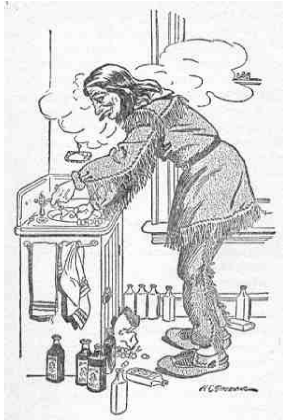
“Life began to look rosy again...”

“Fake? No, sir. There was two dollars’ worth of fluid extract of cinchona and a dime’s worth of aniline in that half-gross of bitters. I’ve gone through towns years afterwards and had folks ask for ‘em again.