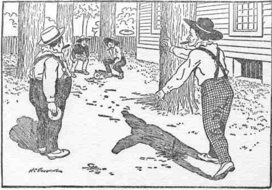
“Pitching quoits in the afternoon in the court house yard.”