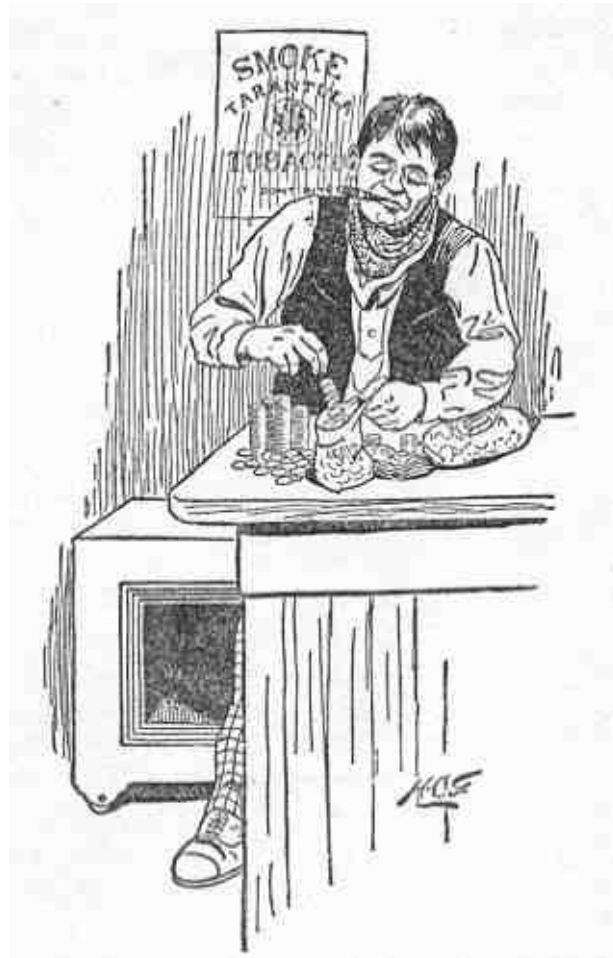
“Andy was especial inroaded by self-esteem.”

“‘Jeff,’ says he, ‘I don’t suppose that anywhere in the world you could find three cormorants with brighter ideas about down-treading the proletariat than the firm of Peters, Satan and Tucker, incorporated. We have sure handed the small consumer a giant blow in the sole apoplectic region. No?’