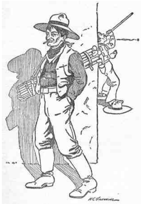
“Selling walking canes.”

“‘Jeff,’ says Bill to me, ‘you are a man of learning and education, besides having knowledge and information concerning not only rudiments but facts and attainments.’