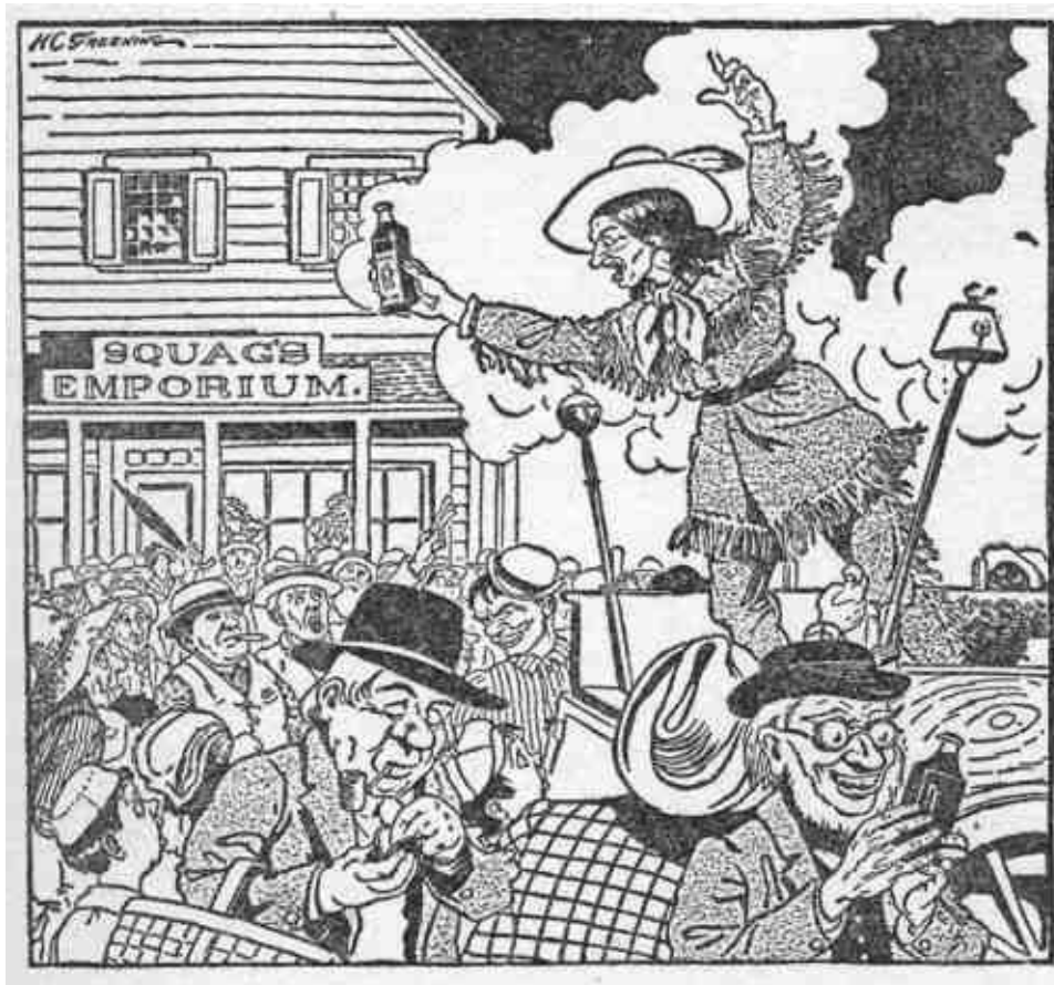
“I ... commenced selling the bitters on Main Street.”

“‘Constable,’ says I, ‘it’s a fine night.’