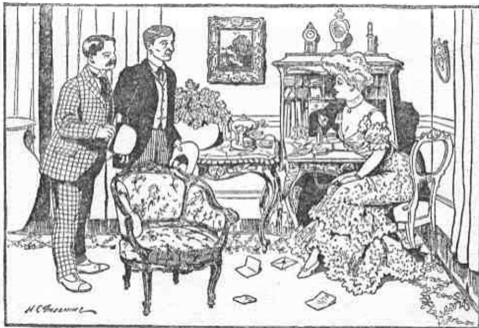
“‘Well boys, what is it?’”

“‘Well, boys,’ says she after a bit, ‘what is it?’”