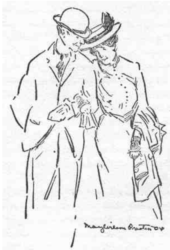
She is a peach and of the cling variety.

Then, lo and look ye! Up the road from the other way jogs Parleyvoo Pickens in a gig, dressed in black, white necktie, long face, sniffing his nose, emitting a spurious kind of noise resembling the long meter doxology.