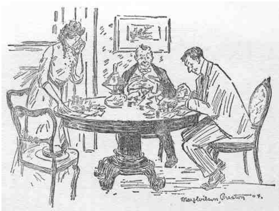
On the 15th day of May us three divided about $6,000.

On the 15th day of May us three divided about $6,000. Miss Malloy nearly cried with joy. You don't often see a tenderhearted girl or one that is bent on doing right.