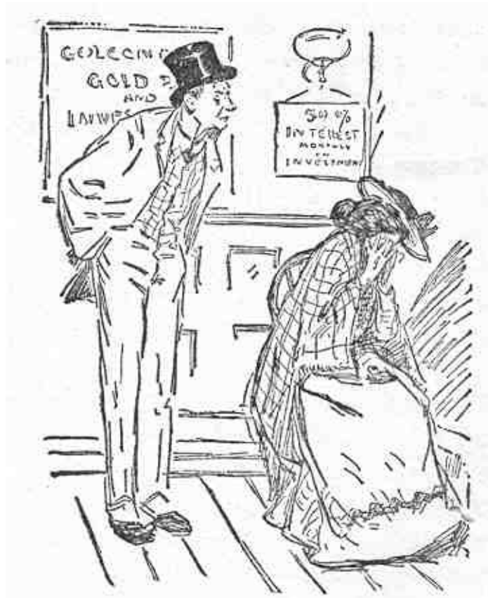
“Jakey won’t marry me now. He’ll take Rosa Steinfeld.”

Buck looks all around with that same funny look on his face. And then we see leaning against the wall, puffing at his pipe, with his eye shining at us, this newspaper reporter. Buck and me walks over to him.