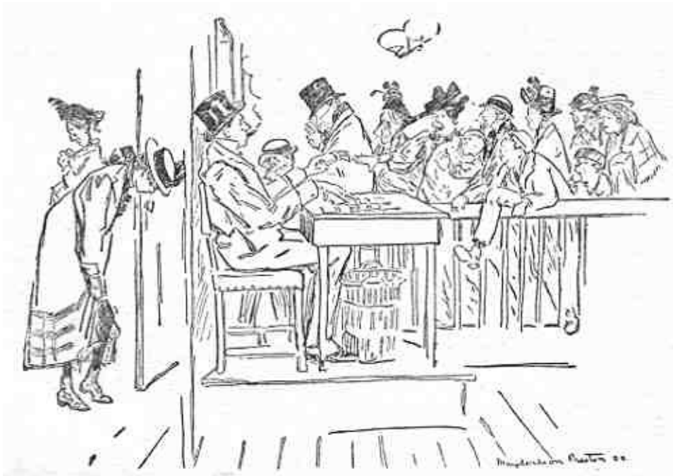
The shareholders of the Golconda Gold Bond and Investment Company can't hardly believe it.

The old women's fingers shake when they stuff the skads in the bosom of their rusty dresses. The factory girls just stoop over and flap their dry goods a second, and you hear the elastic go "pop" as the currency goes down in the ladies' department of the "Old Domestic Lisle-Thread Bank."