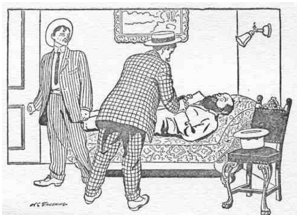
“We put the certificate of stock in the cigarman’s hand.”

“‘We put the certificate of stock in the cigar man’s hand and went out to pack our suit cases.