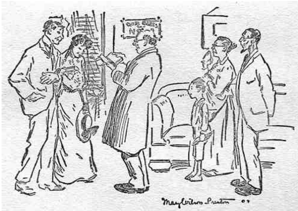
So the Reverend Green, after hesitations, marries 'em in the farmer's parlor.

I suppose I happened along in time to marry Buck and Miss Malloy at about twenty farm-houses. I hated to think how the romance was going to fade later on when all them marriage certificates turned up in banks where we'd discounted 'em, and the farmers had to pay them notes of hand they'd signed, running from $300 to $500.