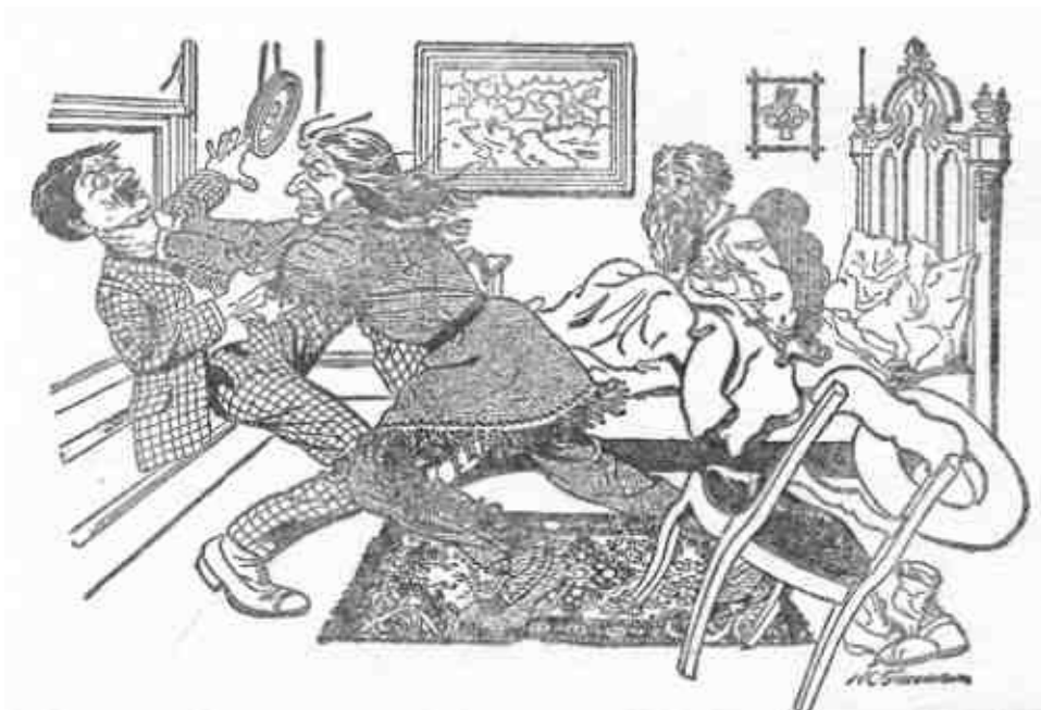
“And I grabs Biddle by the throat.”

“Let’s see you do it,’ says I, and I grabs Biddle by the throat and half throws him out the window, but he pulls a gun and sticks it under my chin, and I stand still. Then he puts handcuffs on me, and takes the money out of my pocket.