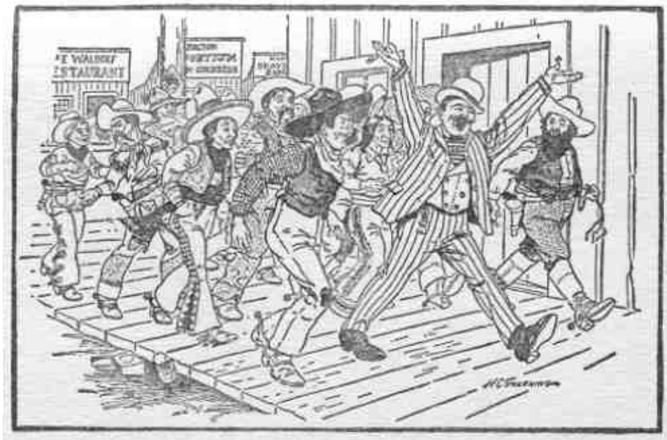
“And he leads ‘em down the main street of Bird City.”

see him waving his arms and elocuting at a good-sized crowd on a corner. When he walks away they string out after him, talking all the time; and he leads 'em down the main street of Bird City with more men joining the procession as they go. It reminded me of the old legerdemain that I'd read in books about the Pied Piper of Heidsieck charming the children away from the town.