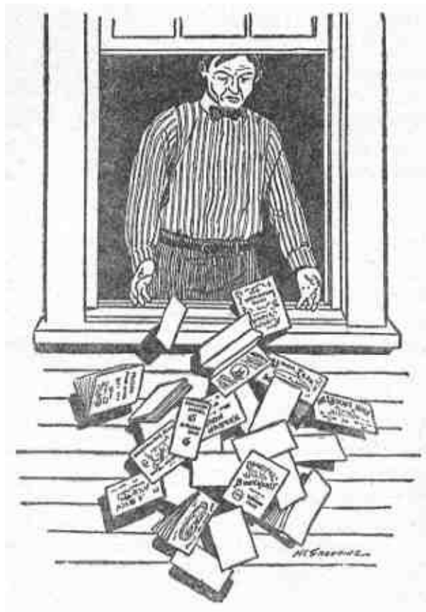
“Dumps the books out of the back window.”

“So me and Andy dumps the books out the back window and packs our trunk and takes the 6 o'clock Tortoise Flyer for Crow Knob, a kind of a dernier resort in the mountains on the line of Tennessee and North Carolina.