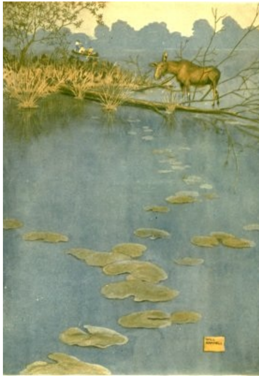
SHOOTING THE MOOSE

There, to be sure, she lay perfectly dead, just where she had stood to receive the last shots. Using a tape, I found that the moose measured six feet from the shoulder to the tip of the hoof, and was eight feet long.