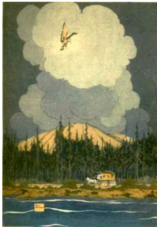
THE STAGE ON THE ROAD TO MOOSEHEAD LAKE

At the Bangor House we took in four men bound on a hunting excursion, one of the men going as cook. They had a dog, a middling-sized brindled cur, which ran by the side of the stage, his master showing his head and whistling from time to time. But after we had gone about three miles the dog was suddenly missing, and two of the party went back for him, while the stage, which was full of passengers, waited. At length one man came back, while the other kept on. This whole party of hunters declared their intention to stop till the dog was found, but the very obliging driver was ready to wait a spell longer. He was evidently unwilling to lose so many passengers, who would have taken a private conveyance, or perhaps the other line of stages, the next day. Such progress did we make, with a journey of over sixty miles to be accomplished that day, and a rainstorm just setting in. We discussed the subject of dogs and their instincts till it was threadbare, while we waited there, and the scenery of the suburbs of Bangor is still distinctly impressed on my memory.