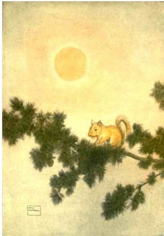
THE RED SQUIRREL

white pines towering above the surrounding forest, or else they form extensive forests by themselves. I should have liked to come across a large community of pines which had never been invaded by the lumbering army.