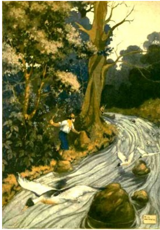
COMING DOWN THE RAPIDS

He complained that it strained him to paddle so hard in order to keep his canoe straight in its course, having no one in the bows to aid him, and, shallow as it was, said that it would be no joke to upset there, for the force of the water was such that he had as lief I would strike him over the head with a paddle as have that water strike him. Seeing him come out of that gap was as if you should pour water down an inclined and zigzag trough, then drop a nutshell into it, and, taking a short cut to the bottom, get there in time to see it come out, notwithstanding the rush and tumult, right side up, and only partly full of water.