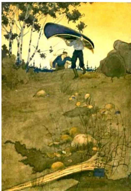
CARRYING ROUND THE FALLS

He said that he and his companions when they came to carries several miles long used to try who would get over first; each perhaps with a canoe on his head. I bore the sign of the kettle on my brown linen sack for the rest of the voyage.