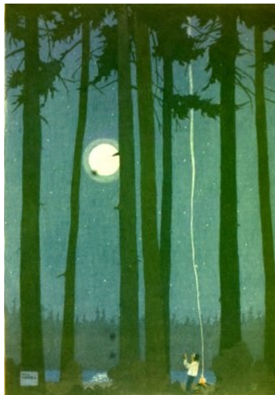
THE INDIAN GUIDE'S EVENING PRAYER (PAGE 59)

HOUGHTON MIFFLIN COMPANY Boston and New York