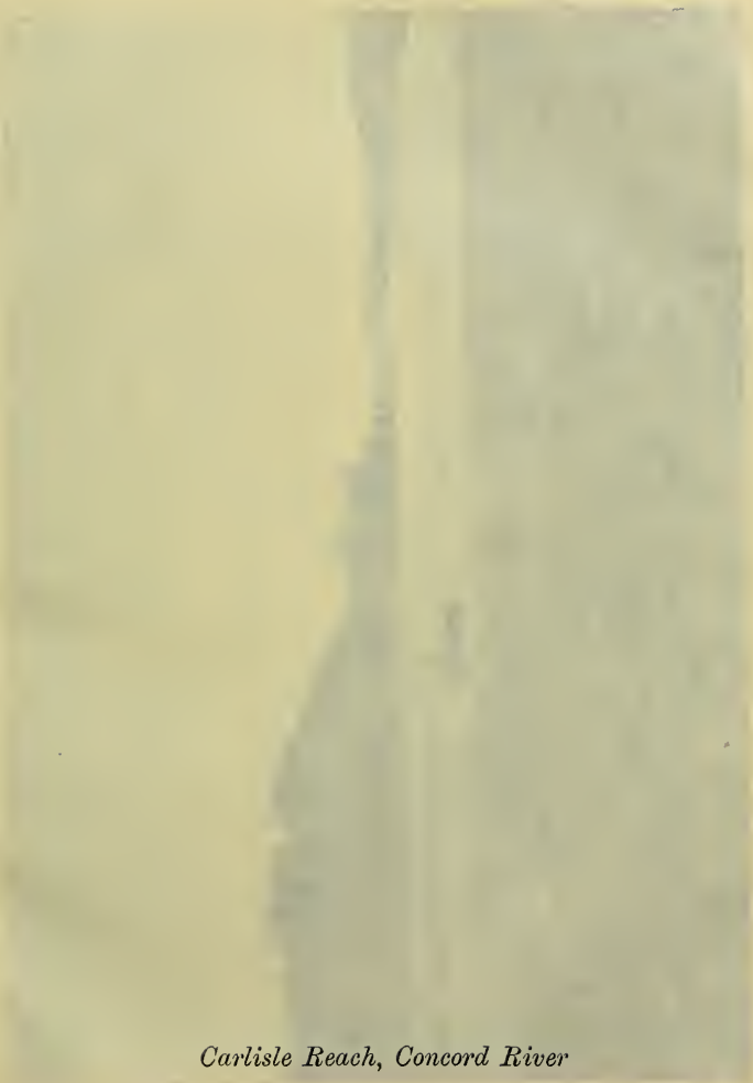
Carlisle Reach, Concord River