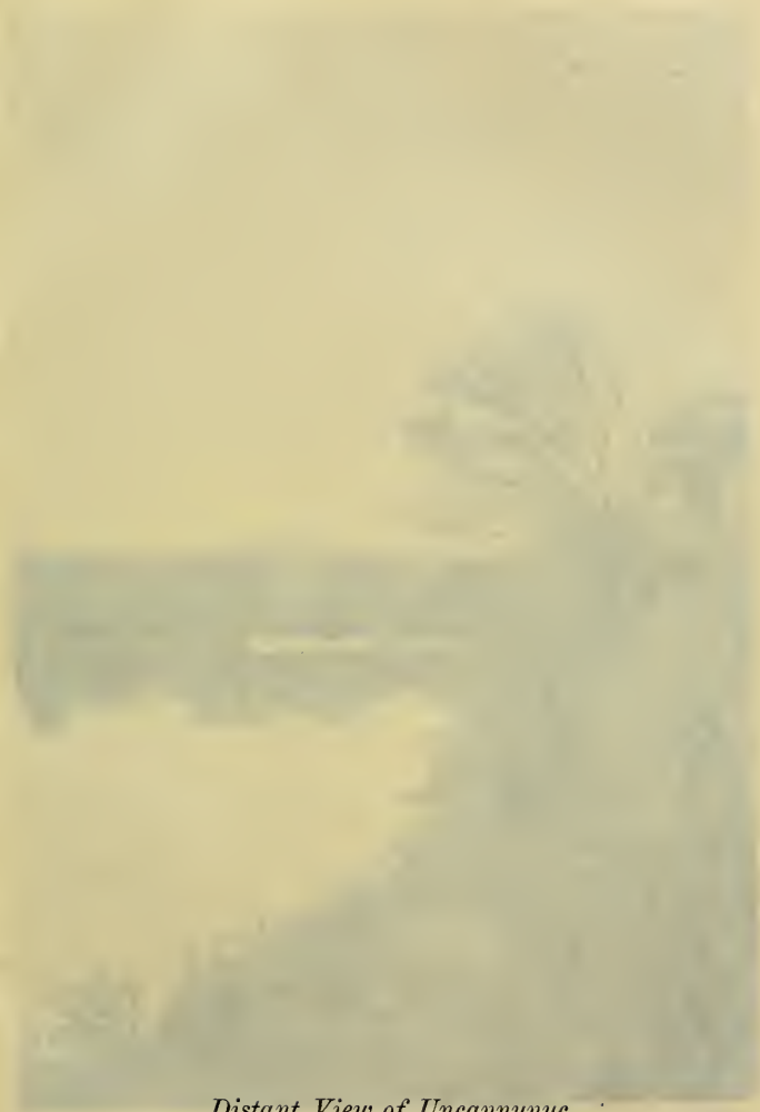
Distant View of Uncanninuc