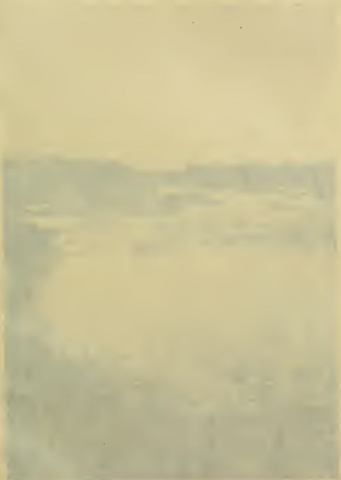
The Merrimac at Goff's Falls