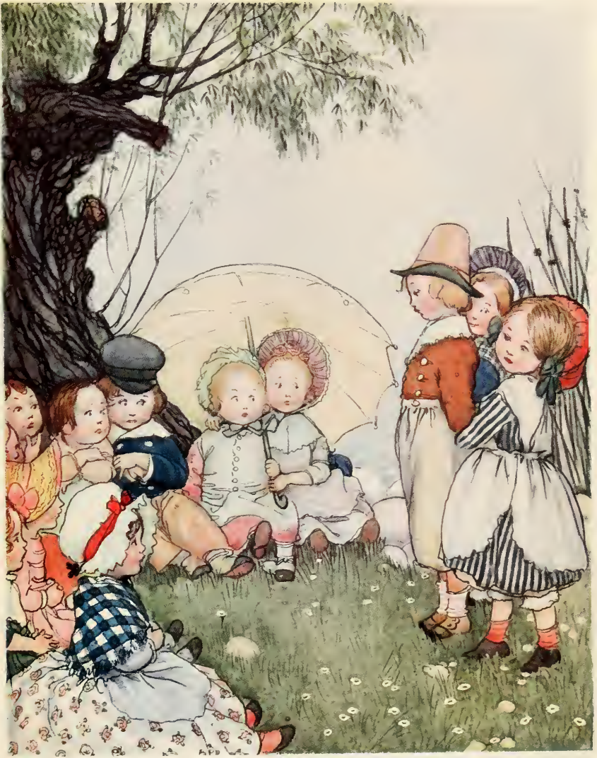
The court was held on the grass by the pond.