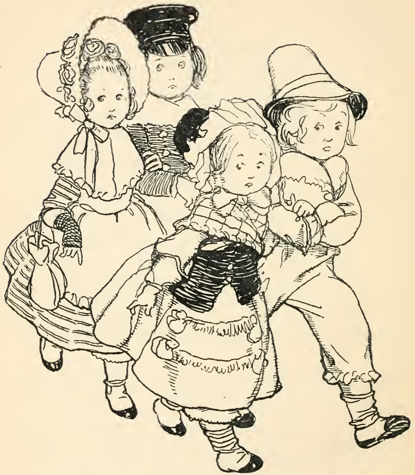
"THE PIRATE-COLONEL WITH HIS BRIDE, AND YESTERDAY'S GALLANT PRISONER WITH HIS BRIDE."