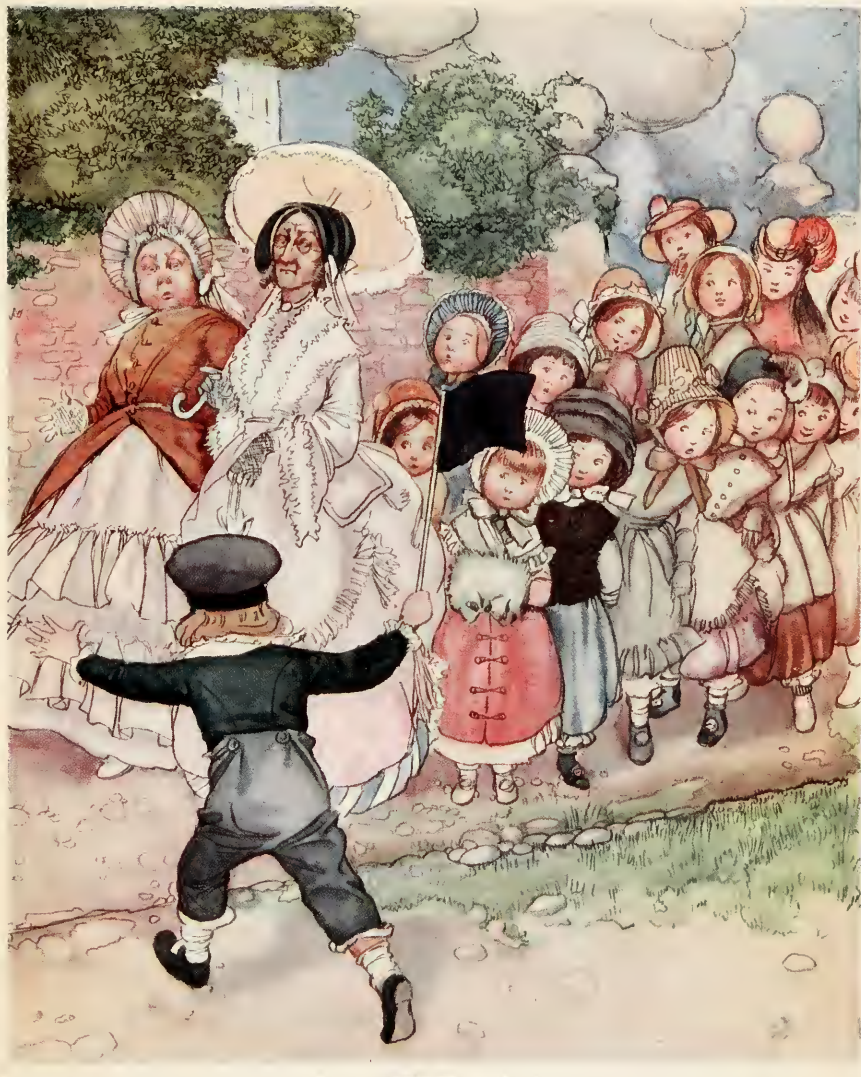
Waving his black flag, the Colonel attacked.