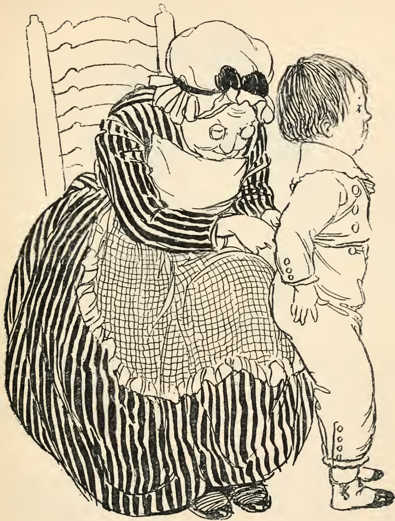
“SEWN UP IN SEVERAL PLACES.”