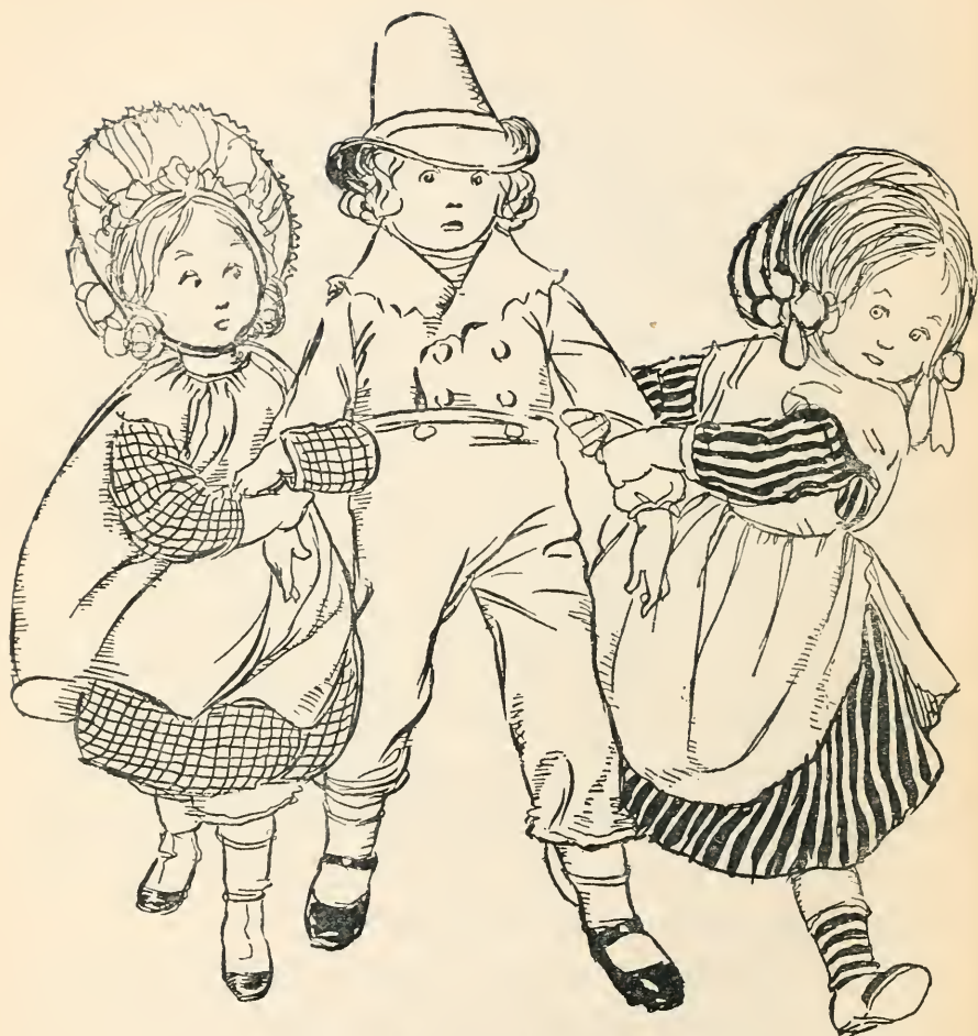
“TWO EXECUTIONERS WITH PINAFORES REVERSED.”