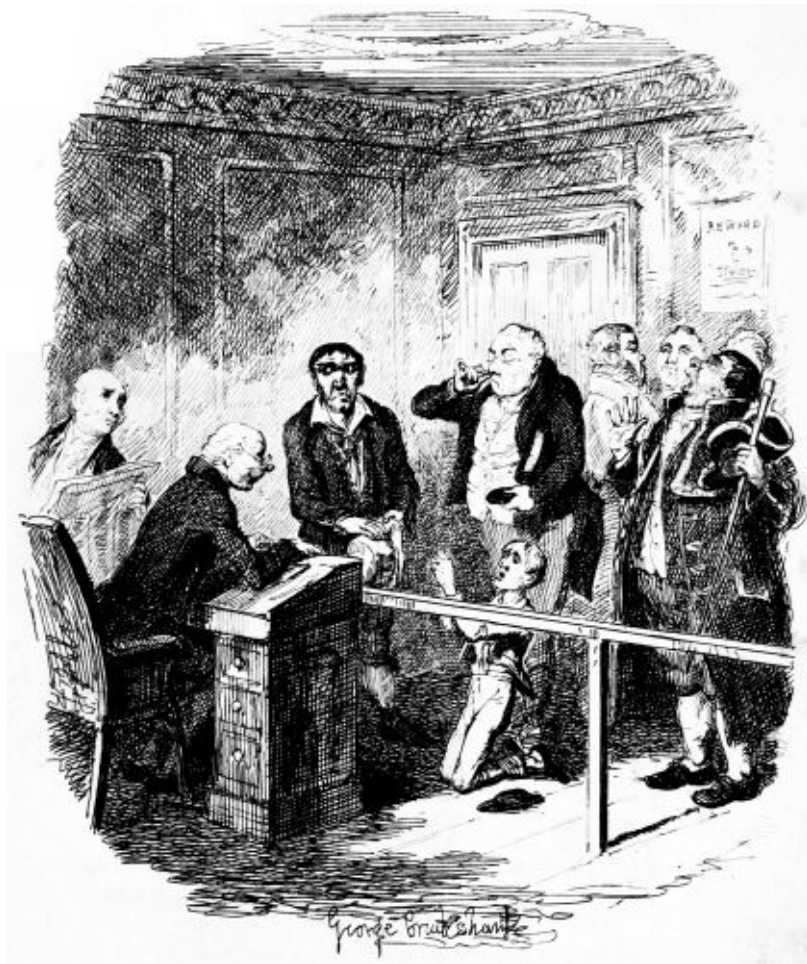
Oliver escapes being bound apprentice to the Sweep.

Oliver fell on his knees, and clasping his hands together, prayed that they would order him back to the dark room—that they would starve him—beat him—kill him if they pleased—rather than send him away with that dreadful man.