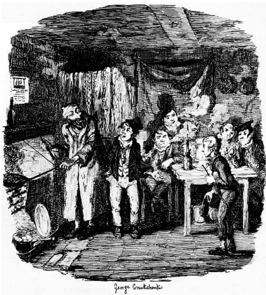
Oliver introduced to the respectable Old Gentleman.

handkerchiefs were hanging. Several rough beds made of old sacks were huddled side by side on the floor; and seated round the table were four or five boys, none older than the Dodger, smoking long clay pipes and drinking spirits with the air of middle-aged men. These all crowded about their associate as he whispered a few words to the Jew, and then turned round and grinned at Oliver, as did the Jew himself: toasting-fork in hand.