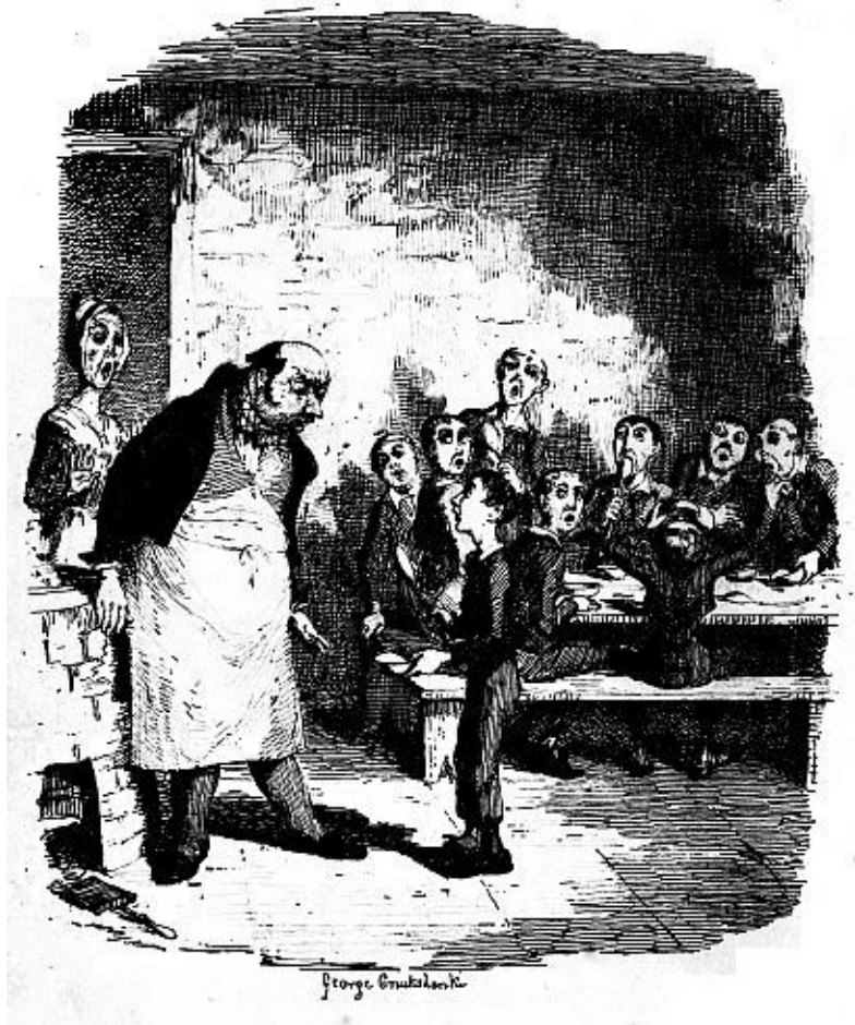
Oliver asking for more.

composed; employing themselves meanwhile in sucking their fingers most assiduously, with the view of catching up any stray splashes of gruel that might have been cast thereon. Boys have generally excellent appetites. Oliver Twist and his companions suffered the tortures of slow starvation for three months; at last they got so voracious and wild with hunger, that one boy, who was tall for his age, and hadn't been used to that sort of thing, (for his father had kept a small cook's shop,) hinted darkly to his companions, that unless he had another basin of gruel per diem , he was afraid he should some night eat the boy who slept next him, who happened to be a weakly youth of tender age. He had a wild, hungry eye, and they implicitly believed him. A council was held; lots were cast who should walk up to the master after supper that evening, and ask for more; and it fell to Oliver Twist.