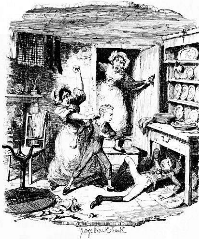
Oliver plucks up a spirit.

“He’ll murder me!” blubbered Noah. “Charlotte! missis! here’s the new boy a-murdering of me! Help! help! Oliver’s gone mad! Char—lotte!”