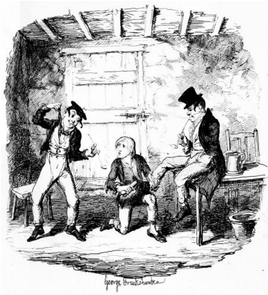
Master Bates explains a professional technicality.

Master Bates nodded assent, and would have spoken, but that the recollection of Oliver’s flight came so suddenly upon him, that the smoke he was inhaling got entangled with a laugh, and went up into his head, and down into his throat, and brought on a fit of coughing and stamping about five minutes long.