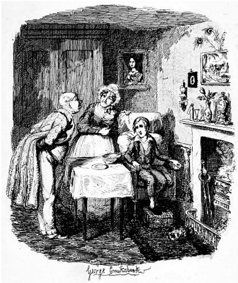
Oliver recovering from the fever.

“Poor boy, poor boy!” said Mr. Brownlow, clearing his throat. “I’m rather hoarse this morning, Mrs. Bedwin; I’m afraid I have caught cold.”