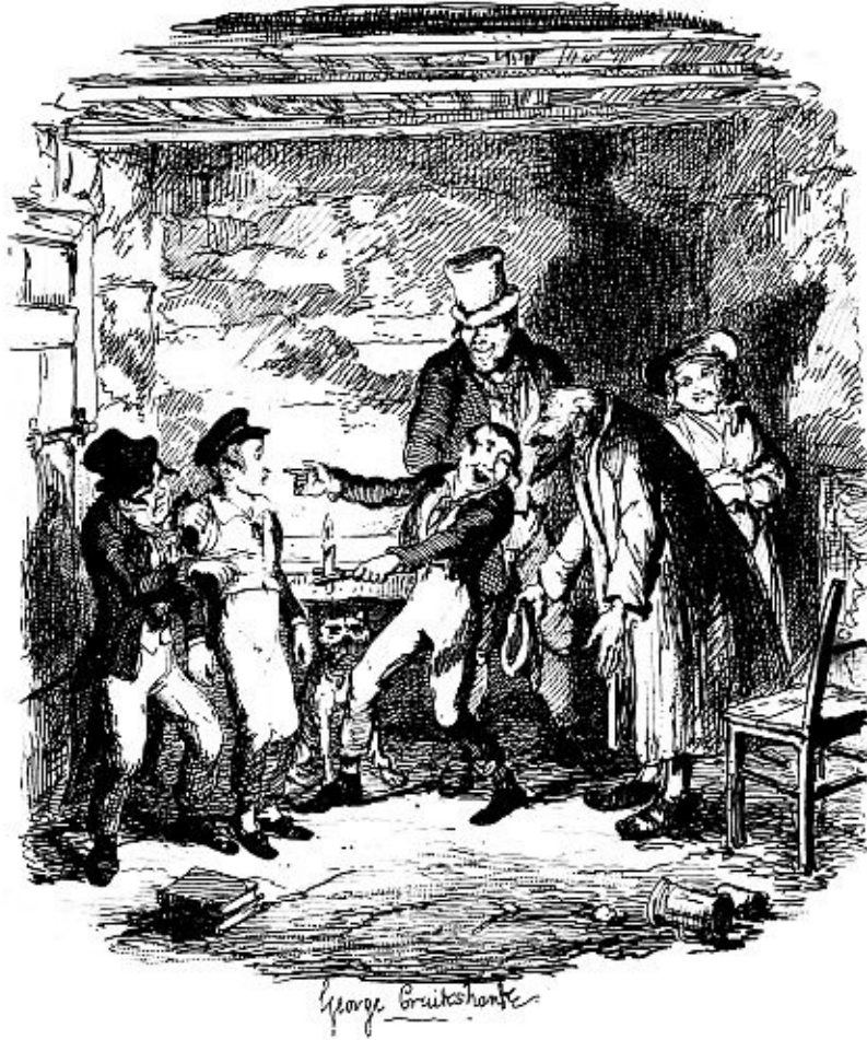
Oliver's reception by Fagin and the boys.

Which will be published forthwith in BENTLEY'S MISCELLANY.