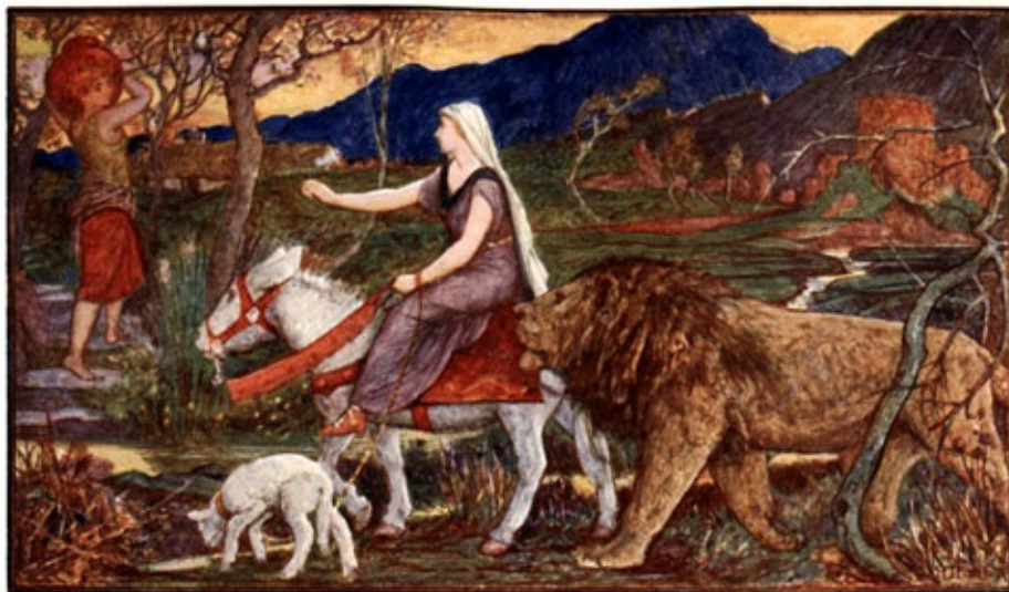
At the sight of the Lion, she flung down the pitcher

Many times he called, but the two women were in grievous dread of the lion, and durst not move from the corner where they were crouching; at last the man grew angry, and burst the door asunder, as the lion had done before him. He entered the hut, and straightway beheld the dreadful beast, with glaring eyes and gleaming teeth, as Una had first beheld him. But Kirkrapine (such was his name) had neither beauty nor goodness to still the lion's rage, and in another moment his body was rent in a thousand pieces.