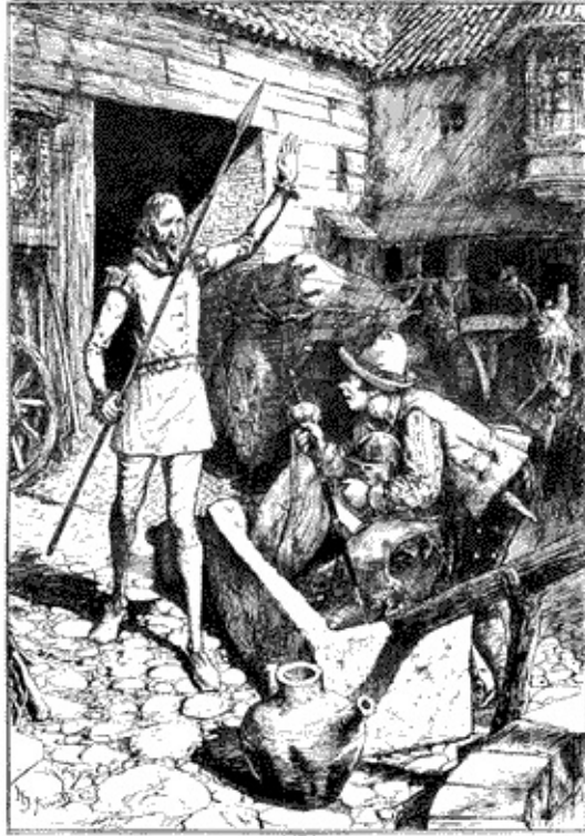
DON QUIXOTE BELABOURS THE MULETEER