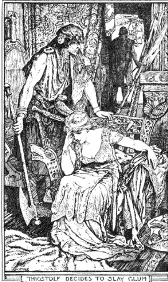
THIOSTOLF DECIDES TO SLAY GLUM

‘Then it is by your hand,’ she answered.