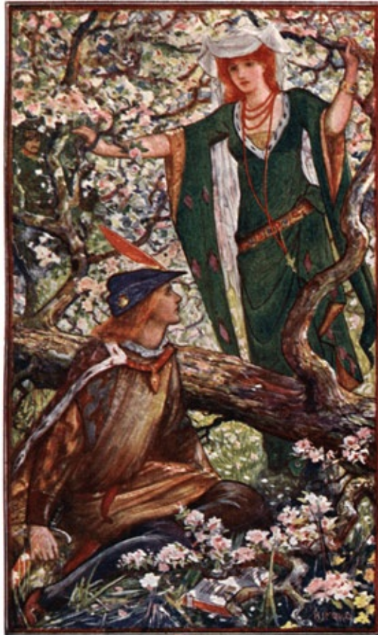
Softly she rose to her feet and stole out of the wood

It was not long before her quick-glancing eyes beheld Sir Amys lying under a tree by the side of a stream, but in her guile she took no heed of him, but turned away and entered a little wood.