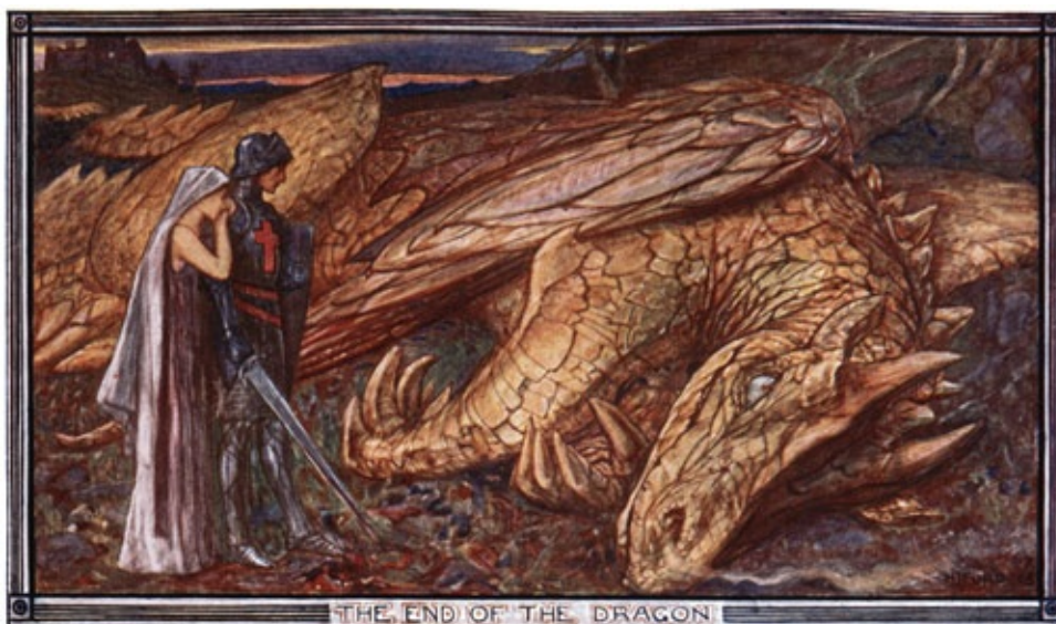
THE END OF THE DRAGON

The knight felt that if he was to win the victory at all it must be by means of his lightness of foot, as the monster was so large he could not turn himself about quickly. So, getting a little behind his head, he tried to pierce his neck between the scaly plates, but the spear glanced off harmlessly, and a stroke from the tip of the tail laid both him and his horse on the ground.