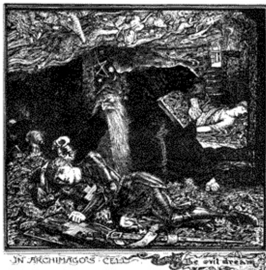
IN ARCHIMAGO'S CELL. The evil dream.

bend in the path brought him face to face with a mighty Saracen, bearing on his arm a shield with the words 'Sans foy' written across it. By his side, mounted on a palfrey hung with golden bells, was a lady clad in scarlet robes embroidered with jewels, who chattered merrily as they passed along.