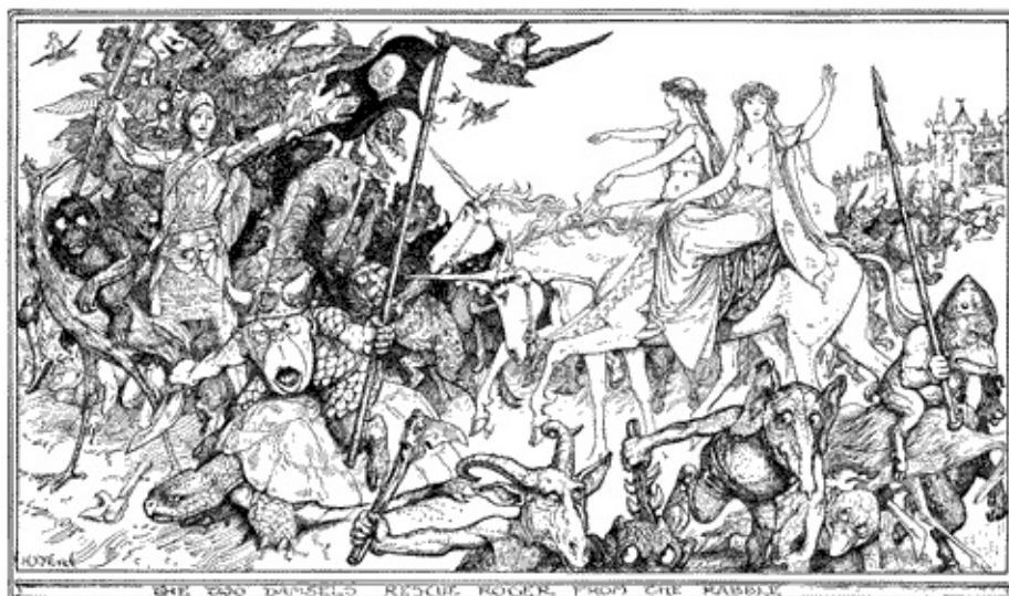
THE TWO DAMSELS RESCUE ROGER FROM THE RABBLE

He lifted his head lazily, and smiled, but the face of his old master was grave as he said sternly: