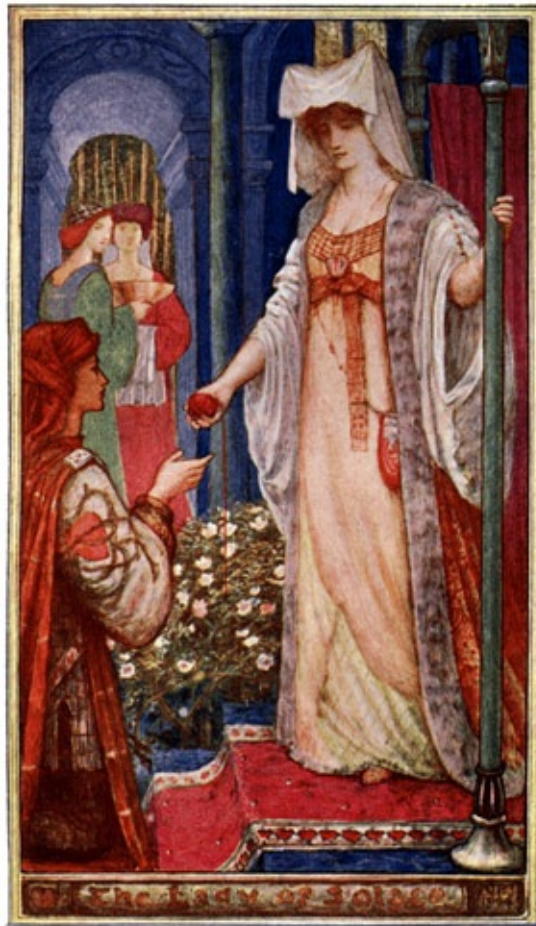
The Lady of Solace

The princess had scarcely finished these words when the voice of the chamberlain was heard without, bidding him withdraw, and, glancing gratefully at her, the knight bowed low and took his leave.