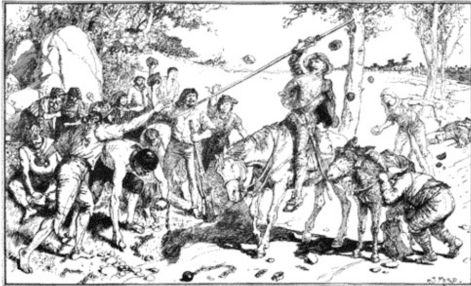
HOW THE GALLEY SLAVES REPAID DON QUIXOTE HOW THE GALLEY SLAVES REPAID DON QUIXOTE

At this the convicts only laughed, and replied that if they were to fulfil his desires and travel together in a body they would soon be taken captive by their enemies, and would be no better off than before, but that in gratitude for his services they would be willing to pray for him, which they could do at their leisure.