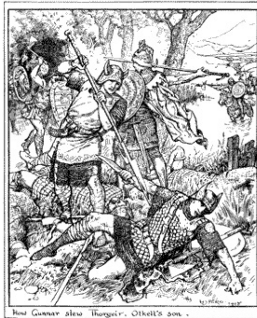
How Gunnar slew Thorgeir, Otkell's son.

By ill-fortune the words which Njal had spoken when he bade Gunnar never to slay more than one man of the same race were noised abroad, and his enemies made a plan by which Gunnar should be forced to fight Thorgeir, son of Otkell, so that his doom might come upon him.