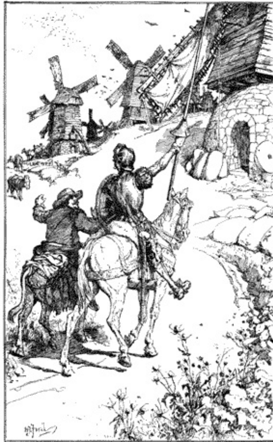
DON QUIXOTE DETERMINES TO ATTACK THE WINDMILLS

‘How little do you know, friend Sancho, of these sorts of adventures!’ replied Don Quixote. ‘I tell you, those are no windmills, but giants. Know, however, that I will have no man with me who shivers with fear at the sight of a foe, so if you are afraid you had better fall to praying, and I will fight them alone.’