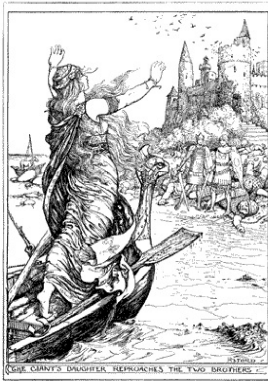
THE GIANT'S DAUGHTER REPROACHES THE TWO BROTHERS

No sooner had he stepped on shore than the damsel pushed off, crying as she did so to her brothers and their knights to avenge the giant's wounds. In a moment all the little island was alive with men, whirling lances or swords or axes above their heads, and all pressing forward to the spot where Rosiclair awaited them. Luckily he had time to place himself with the sea at his back, so that he could not be attacked from behind, and, covering himself with his shield, stood ready.