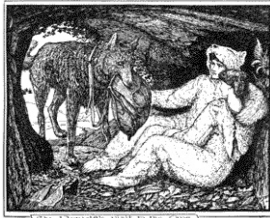
The Werwolf's visit to the Cave