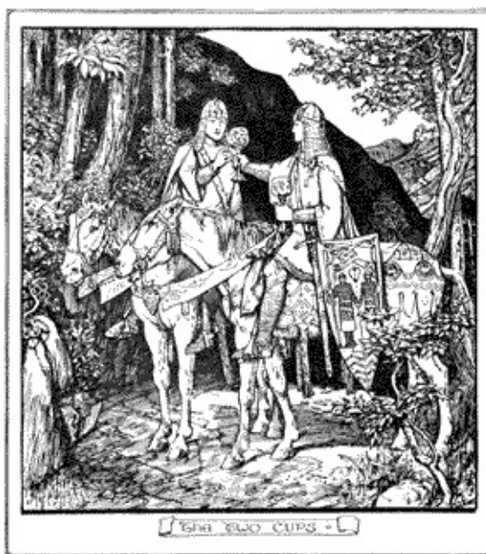
THE TWO CUPS

from the most beautiful maidens in the Duchy of Lombardy, no matter what might be their degree. So a herald was sent forth to proclaim that any damsel who wished to fill this high place was to present herself in the courtyard of the palace on the morning following the next new moon, where the chamberlain would receive her. Oh, what a fluttering of hearts there was in the towns and villages, as the herald, with his silver trumpet and his satin coat of red and yellow, covered with figures of strange beasts, passed up and down the streets! How the girls all ran to their mirrors, and turned themselves this way and that to see if there could possibly be a chance for them! Perhaps it was the fault of the headdress they wore that their faces seemed so long and their noses so big, or surely something was wrong with the glass that their cheeks looked so yellow! But even when it was proved beyond a doubt that neither headdress nor mirror was to blame in the matter, there were enough lovely maidens and to spare in the courtyard of the castle on the day following the new moon.