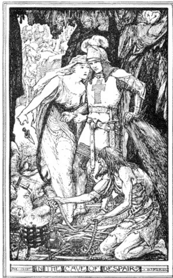
IN THE CAVE OF DESPAIR

In spite of Sir Trevisan's warning, the fair-sounding words found an echo in the heart of the Red Cross Knight, as they had done in the hearts of many men before him. The miscreant saw that his courage was wavering, and forthwith he brought forth a store of swords, ropes, poisons, and a brazier of fire, and bade him choose what manner of death he would prefer. The knight gazed at them all, like one who walks in sleep, but touched none of them, and the miscreant, beholding this, chose out a dagger bright and new, and thrust it in his shaking hand. The young man looked at it, his face reddened and then grew pale again, and slowly, as if against his will, he lifted the dagger.