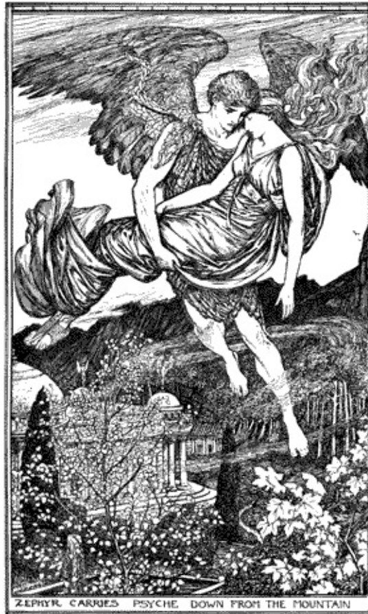
ZEPHYR CARRIES PSYCHE DOWN FROM THE MOUNTAIN

While she slept, pleasant dreams floated through her mind, and her terrors and grief were forgotten. She awoke feeling happy, though she could not have told why, for she was in a strange place and alone. In the distance, through some trees, the spray of a fountain glimmered white, and she rose and walked slowly towards it. By the fountain was a palace, finer by far than the one in which Psyche had lived, for that was built of stone, while this was all of ivory and gold. Vast it was, and full of precious things, as Psyche saw for herself when, filled with wonder mixed with a little fear, she stepped across the threshold.