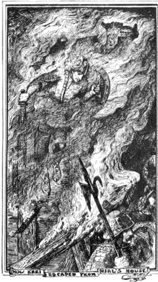
HOW KARI ESCAPED FROM NJAL'S HOUSE

'No!' answered Skarphedinn, 'you go first and I will follow; or, if I follow not, you will avenge me.'