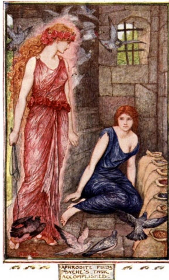
APHRODITE FINDS PSYCHE'S TASK ACCOMPLISHED

‘O Psyche, do my bidding and fear nothing! Hide yourself till evening, for the sheep are driven mad by the heat of the sun, and rush wildly through the bushes and thickets. But when the air grows fresh they sink exhausted to sleep, and you can gather all the wool you want from the branches.’