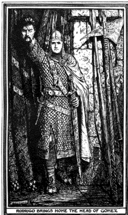
RODRIGO BRINGS HOME THE HEAD OF GOMEZ

Young though he was, Rodrigo had heard enough of war to know Lozano Gomez would not prove an easy prey; but, easy or not, he meant to fight him. So, vowing to his sword that should he ever bring dishonour on the weapon that had done his House good service, he would sheathe it in his breast, he mounted his horse and rode to meet his foe.