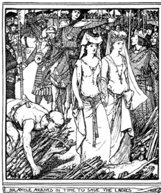
SIR AMYLE ARRIVES IN TIME TO SAVE THE LADIES

‘Come weal or woe, I will help my brother,’ he said softly; then mounting his horse he rode into the lists, and, kneeling, took the oath that he was guiltless of wrong and would prove his innocence on the body of his foe.