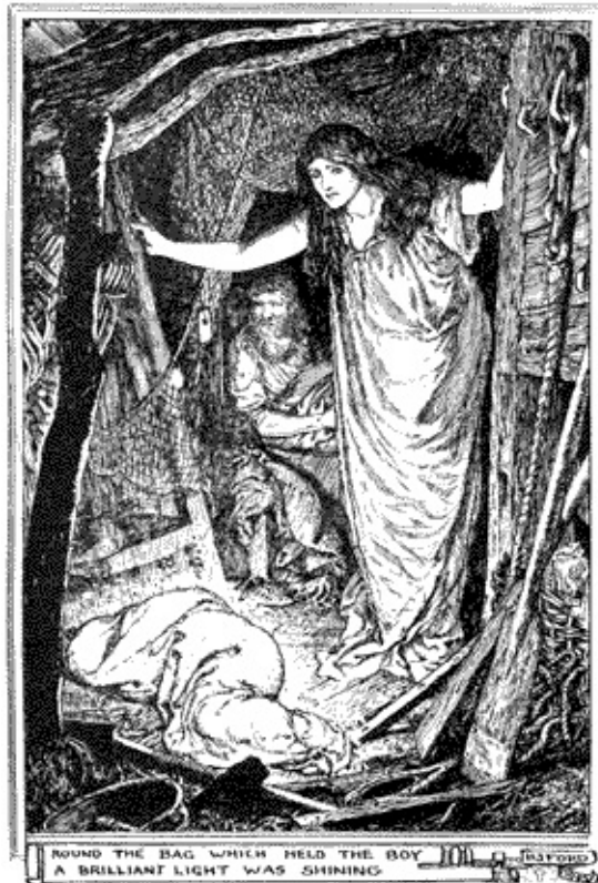
ROUND THE BAG WHICH HELD THE BOY A BRILLIANT LIGHT WAS SHINING

At the dreadful fate of his sisters, Havelok, who was the youngest, fell on his knees and implored the wicked earl to spare him.