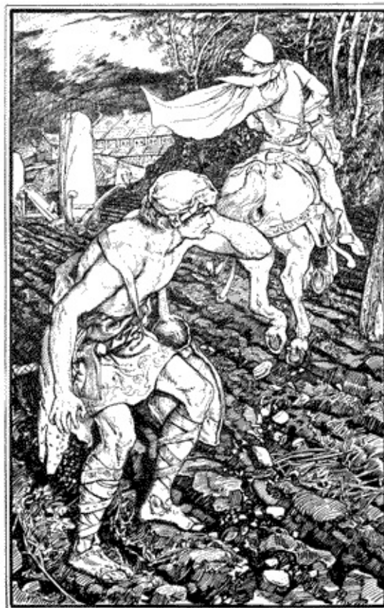
OTKELL AND GUNNAR IN THE FIELD OTKELL AND GUNNAR IN THE FIELD

'You summon me first, and then you ride over me,' he said, and, as was his wont, Skamkell made answer: