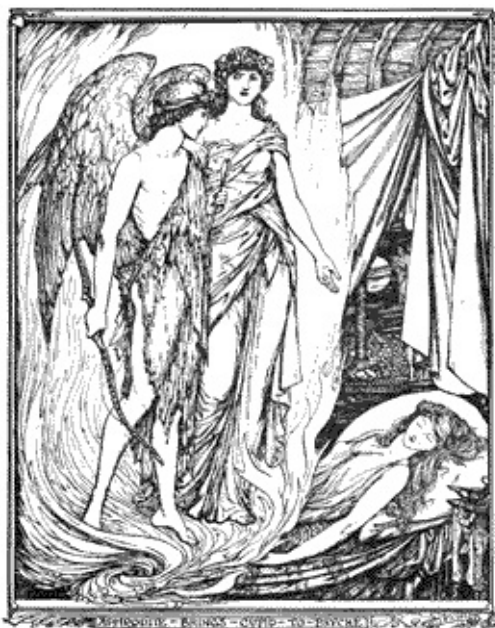
APHRODITE BRINGS CUPID TO PSYCHE

‘Never will I do you such wrong,’ he murmured, ‘as to mate you with some base wretch, who has no thought beyond the wine-cup. From me and my darts you are safe. But am I safe from yours?’ Then, fearing to stay any longer, lest his mother should wax wroth with him, he also took his way to the palace of Oceanos.