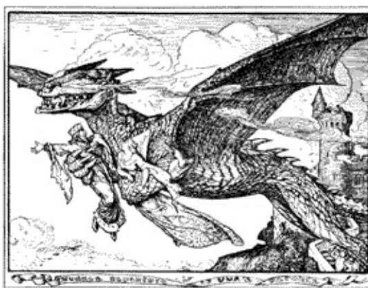
Sudden DEPARTURE of UNA'S PARENTS

It were long to tell the adventures Una met with on the way, but at last she found the knight resting after a hard-won fight, and told him her tale.