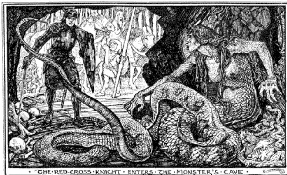
THE RED CROSS KNIGHT ENTERS THE MONSTER'S CAVE

Him the Red Cross Knight stopped and asked if he knew of any adventures which might await him in that place. The old man, who was in truth the magician Archimago, the professor of lore which could read the secrets of men's hearts, answered that the hour was late for the undertaking of such things, and bade them rest for the night in his cell hard by. So saying, he led them into a little dell amidst a group of trees, in which stood a chapel and the dwelling of the hermit.