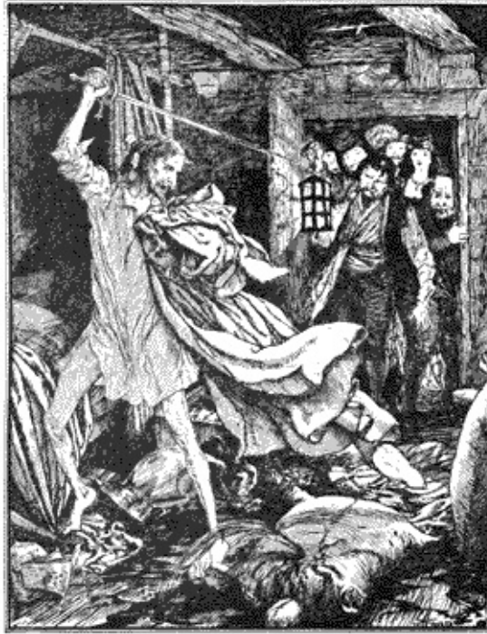
DON QUIXOTE'S BATTLE WITH THE WINE-SKINS