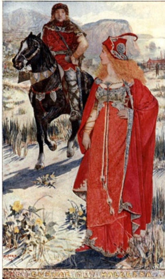
HOW GUNNAR MET HALLGERDA