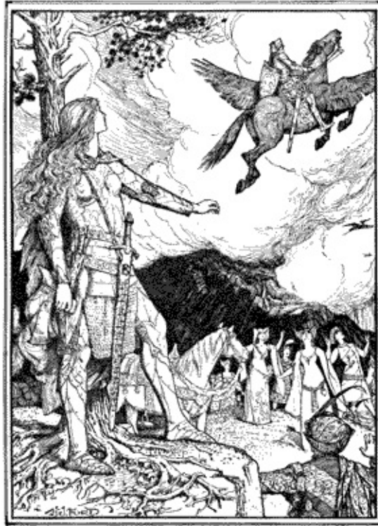
Roger borne away from Bradamante.

‘I crave your pardon,’ answered he, ‘for having unwittingly done you wrong; but tell me who you are, and what has caused your present plight?’