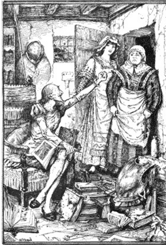
Don Quixada declared that he would give his housekeeper and his niece into the bargain, for the pleasure of bestowing one kick on Ganelon the traitor.

Don Quixada declared that he would give his housekeeper and his niece into the bargain for the pleasure of bestowing one kick on Ganelon the traitor.