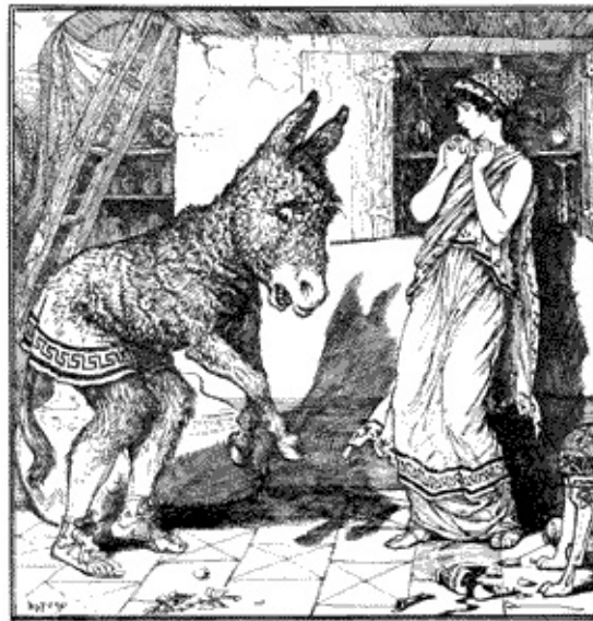
APULEIUS CHANGES INTO AN ASS

That very evening, Hesperus had scarcely risen from his bed when Fotis knocked at the door of the house.