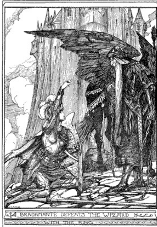
BRADAMANTE DEFEATS THE WIZARD WITH THE RING

Having thus said, Melissa bade Bradamante farewell, and they parted with tears and promises of speedy meeting. Forthwith Bradamante entered an inn hard by, where Brunello was already seated, and if she at once marked him amongst other men he no less knew her, for many a time he had seen her at jousts and tourneys.