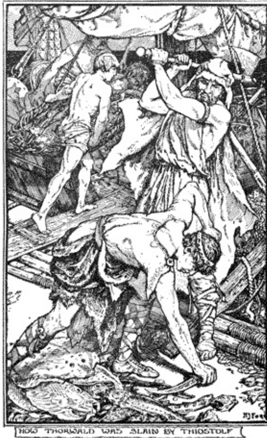
HOW THORWALD WAS SLAIN BY THIOSTOLF

‘I knew not of it,’ said Thiostolf, ‘but I will avenge it speedily;’ and he went to the shore, and put off in a boat, taking nothing but a great axe with him. He found Thorwald and his men on the beach of the biggest island, loading his vessel with meat and fish from the storehouses. Then he began to pick a quarrel with Thorwald and spoke words that vexed him more and more, till Thorwald bent forward to seize a knife which lay near him. This was the moment for which the other had been waiting. He lifted his axe and gave a blow at Hallgerda’s husband, and, though Thorwald tried to defend himself, a second stroke clove his skull.