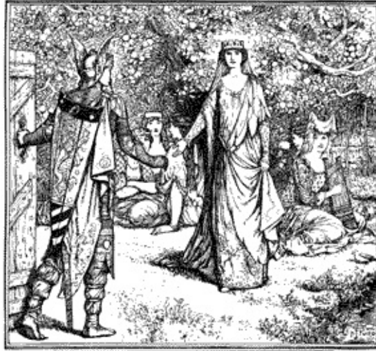
OGIER THE DANE MEETS MORGANE LE FAY AT LAST

She held out her hand, and Ogier placed his within it, and thus they entered the castle. Then she went to her closet and drew a casket from it, and from the casket she took a ring, which she slipped on Ogier's finger. Afterwards she placed on his head a wreath of golden laurels intertwined with bays, and his white hair became once more like sunshine, and the wrinkles faded from his brow. And with the wrinkles faded also the recollection of the battles he had fought, and of Charlemagne himself, and even of Belissande, whom he had loved so well. Soft sounds of singing floated through the palace, and fairies trailing flowers glided in and out in the dance. While Ogier stood entranced and dumb, there entered King Arthur, to whom spoke Morgane le Fay: