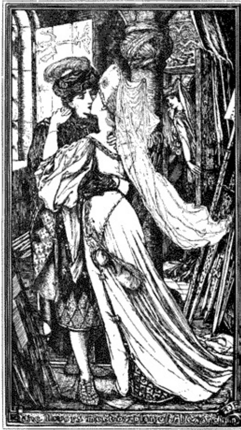
The lovers meet by plan of Alexandrine

Then Melior told her, and Alexandrine listened in amaze. From his childhood William and the two girls had played together, and well Alexandrine knew that the emperor had cast his eyes upon another son-in-law. Still, she loved her cousin, and she loved William too, so she said.