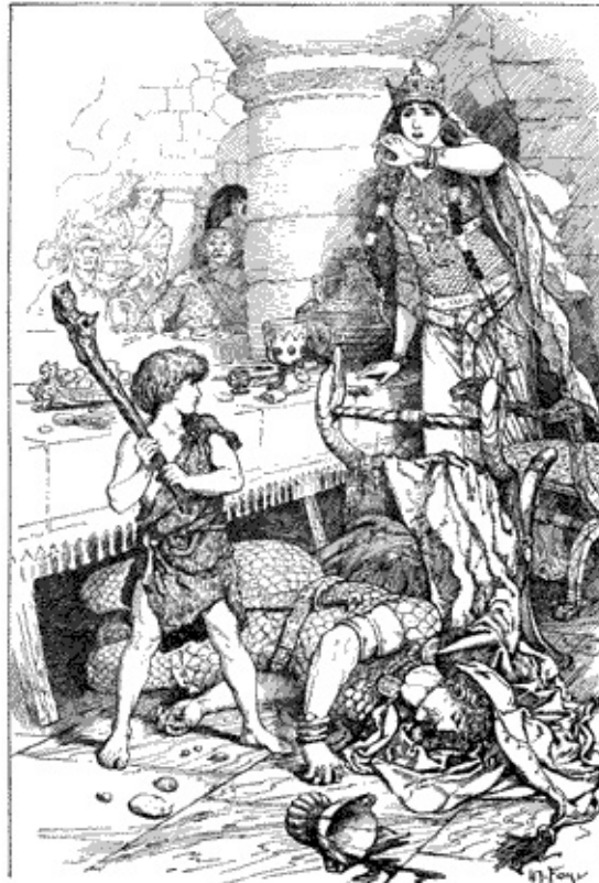
LITTLE BEVIS AVENGES HIS FATHER.