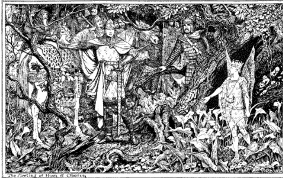
The Meeting of Huon and Oberon

‘Have no fears for me,’ answered Huon, ‘I will be steadfast.’