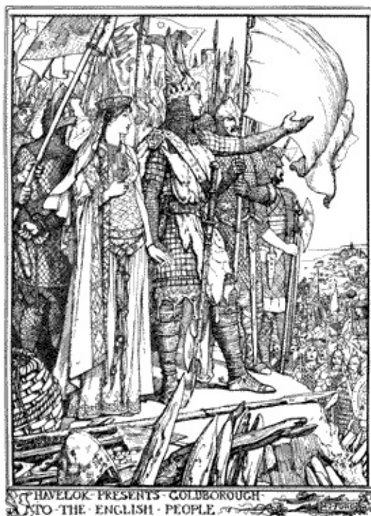
HAVELOK PRESENTS GOLDBOROUGH TO THE ENGLISH PEOPLE.

brothers, and betook himself to the house of Ubbe the earl, whom his father had loved dearly. He said no word as to his birth, but asked him leave to trade on his lands, offering a ring as earnest-money.