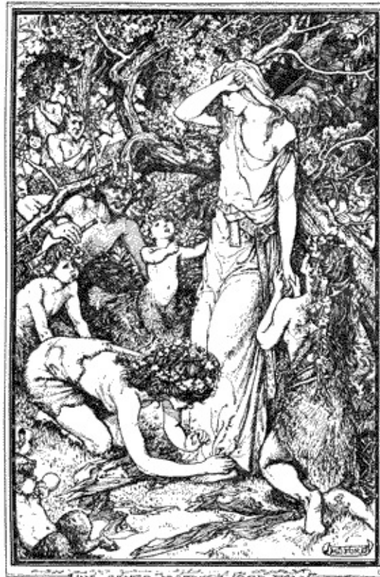
UNA SAVED BY THE WOOD-FOLK

And what had become of Una when she had fallen into the power of Sansloy? Well, trembling she had followed him into the midst of a forest, where, to her wonder, from every bush sprang a host of fauns and people of the wood, and ran towards her. When the Saracen beheld them, he was so distraught with fear that he galloped right away, leaving Una behind him. But she, not knowing what to fear the most, stood shaking with dread, till the wood folk pressed around her, and, kneeling on the ground stroked lovingly her hands and feet. Then she understood that she was safe amongst them, and let them lead her where they would, and smiled at their songs and merry dances. If she could not be with the Red Cross Knight, then it mattered little where she was, and it gave her a feeling of rest and safety to lie hidden among the woods, with a people who would let nothing harmful come near her.