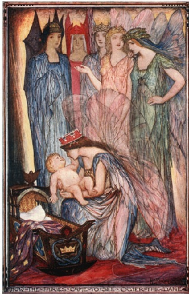
HOW THE FAIRIES CAME TO SEE OGIER THE DANE

Time passed on, and Ogier, for that was the name they gave him, was ten years old. He was tall and strong and could send his arrows farther than most boys many years older. He could handle a spear too, and his thrusts went straight at the mark; while he could sing a song, or touch the lute as delicately as a maiden. His father was proud of him, and it went sore with him when Charlemagne the emperor, who had had a bitter quarrel with the king of Denmark, demanded that Ogier should be sent as a hostage to his court of Paris.