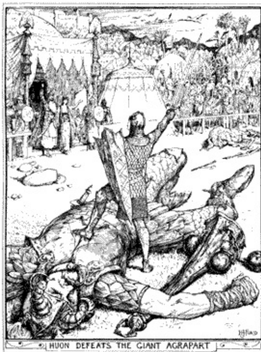
HUON DEFEATS THE GIANT AGRAPART

At length, when the emir was sore beset by the army of the giant Agrapart, she deemed it a favourable time to betray to her father that Huon was still alive in his prison, and was ready to do battle with the giant if, as was usual in that country, the princess’s hand should be given to the victor. Both the emir and the giant agreed that their quarrel should stand or fall by single combat, and so the fight began.