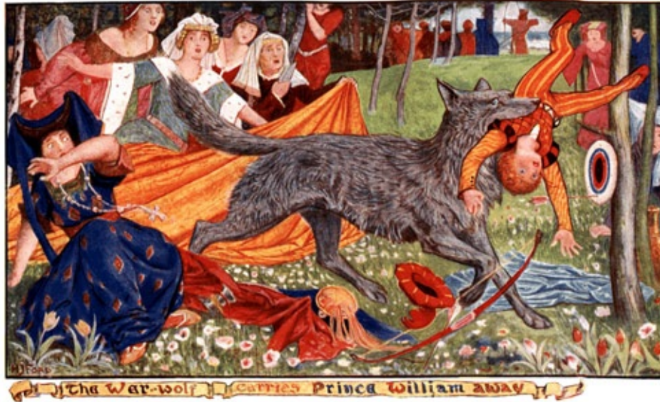
The Wer-Wolf carries Prince William away

For eight days they stayed in the forest, and it seemed to the boy as if he had never dwelt anywhere else. There was so much to see and to do, and when he was tired of playing the wolf told him stories.