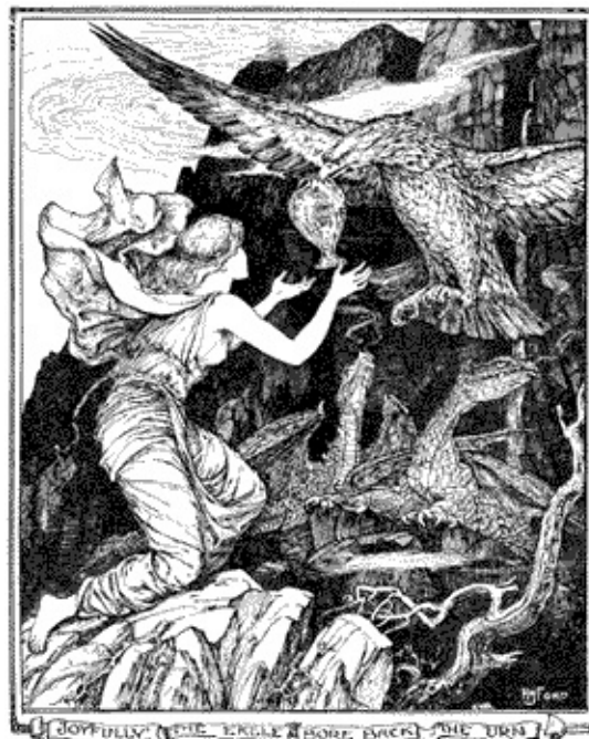
JOYFULLY THE EAGLE BORE BACK THE URN

‘O Psyche, do my bidding and fear nothing! Hide yourself till evening, for the sheep are driven mad by the heat of the sun, and rush wildly through the bushes and thickets. But when the air grows fresh they sink exhausted to sleep, and you can gather all the wool you want from the branches.’