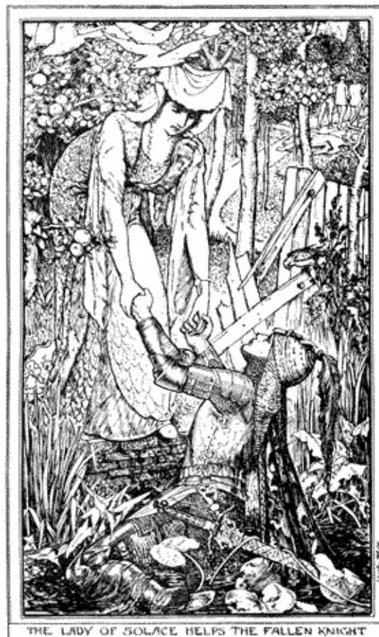
THE LADY OF SOLACE HELPS THE FALLEN KNIGHT

So the knight bowed low and left the hall, going straight to the gatekeeper's house, where he had put off his armour on arriving. On pretence of sharpening his sword, he borrowed a pot of ointment from the man, and, unseen by him, rubbed the paste thickly over his armour. After this he looked about to see that no one was watching him, and took the path that led to the garden.