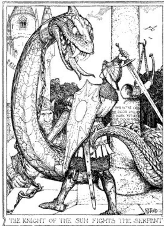
THE KNIGHT OF THE SUN FIGHTS THE SERPENT

Then he took the ivory horn, and entered the door of the first tower. As soon as the Knight of the Sun reached the second tower, he found it was shut by a door of steel, just as the first had been. He sounded a blast on his horn, and the door flew open with a grating and horrible noise, which might have filled the heart of the bravest with terror, and another giant stepped forth, no less horrible to look upon than his brother, with a club in one hand and a huge chained lion in the other. The great beast was larger than any bull that ever was seen, and each of its nails was as long as the foot of a man. Directly its chain was loosed, the lion reared itself up and sprang upon the knight, who awaited it as calmly as if it had been only a sheep. But after the fight with the serpent the attack of the lion seemed quite easy to parry, and, without pausing till they came together, the young man turned nimbly aside and felled him to the earth with the iron staff. After that he turned to meet the giant.