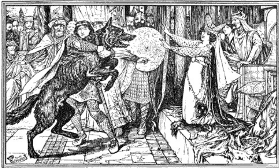
THE FURY OF THE WER-WOLF THE FURY OF THE WER-WOLF

Together they entered the hall, but at the sight of the wicked woman who had done him such ill the wolf's bristles stood up on his back, and with a snarl that chilled the blood of all that heard it he sprang towards the dais. But, luckily, William was on the watch, and, flinging his arms round the wolf's neck, he held him back, saying in a whisper: