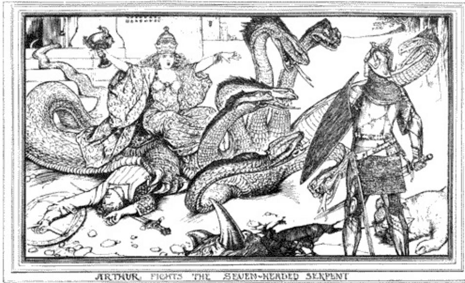
ARTHUR FIGHTS THE SEVEN-HEADED SERPENT

The giant's roars of pain might have been heard in the uttermost parts of the kingdom, and Duessa quickly guided her baleful beast to the help of her wounded friend. But her way was barred by the squire, who, sword in hand, 'stood like a bulwark' between his lord and the serpent. Duessa, full of wrath at being foiled, turned the serpent on him, but not one foot would the squire move till, beside herself with anger, the witch drew out her cup and sprinkled him with the poisonous water. Then the strength went out of his arms and the courage from his heart, and he sank helpless on the ground before the snake, who fain would have trampled the life out of him, and it would have fared ill with him had not the knight rushed swiftly to his rescue, and dealt the snake such a wound that the garments of Duessa were all soaked in blood. She shrieked to the giant that she would be lost if he did not come to her aid, and the giant, whose one arm seemed to have gained the strength of two, struck the knight such a blow on the helmet that he sank heavily on the ground.