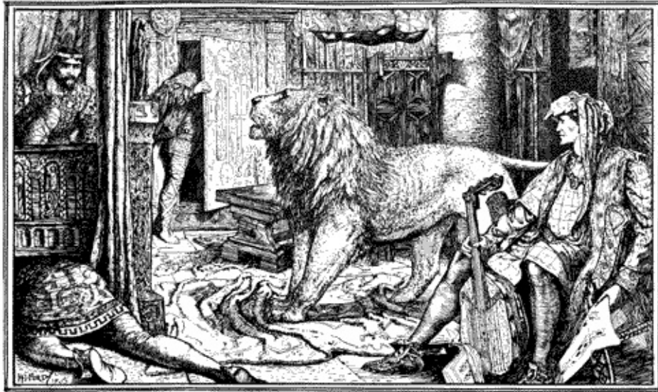
• DON DIEGO AND DON FERNAN SHOW THAT THEY ARE COWARDS • DON DIEGO AND DON FERNAN SHOW THAT THEY ARE COWARDS

say that he was willing to pardon him. And the Cid vowed anew to serve him, but his heart was heavy for the death of his only son in the siege of Consuegra.