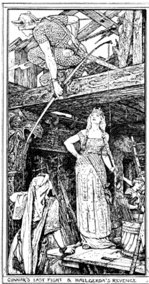
GUNNAR'S LAST FIGHT & HALLGERDA'S REVENGE

It was in the autumn that Mord, the son of Valgard, sent word to Gunnar’s foes that the time had come to make the attack upon Lithend, as all his men had gone to the haymaking on the isles of the sea. So they set forth secretly, but stopped first at the farm nearest to Lithend, where they seized the farmer, and warned him that unless he came with them and put to death the hound Sam which had guarded Gunnar ever since Olaf the Peacock had bestowed him as a gift, his own life should be forfeit. Thorkell the farmer was sore at heart when he heard what was required of him, but he took his axe and went with the rest. It was easy to entice Sam the hound into a hollow dell; but when he saw the crowd of men behind Thorkell he knew that evil was afoot, and sprang on Thorkell and tore open his throat. Then Aumond of Witchwood smote him on the head with his axe, and Sam gave a howl which was not the utterance of any mortal dog, and rolled over.