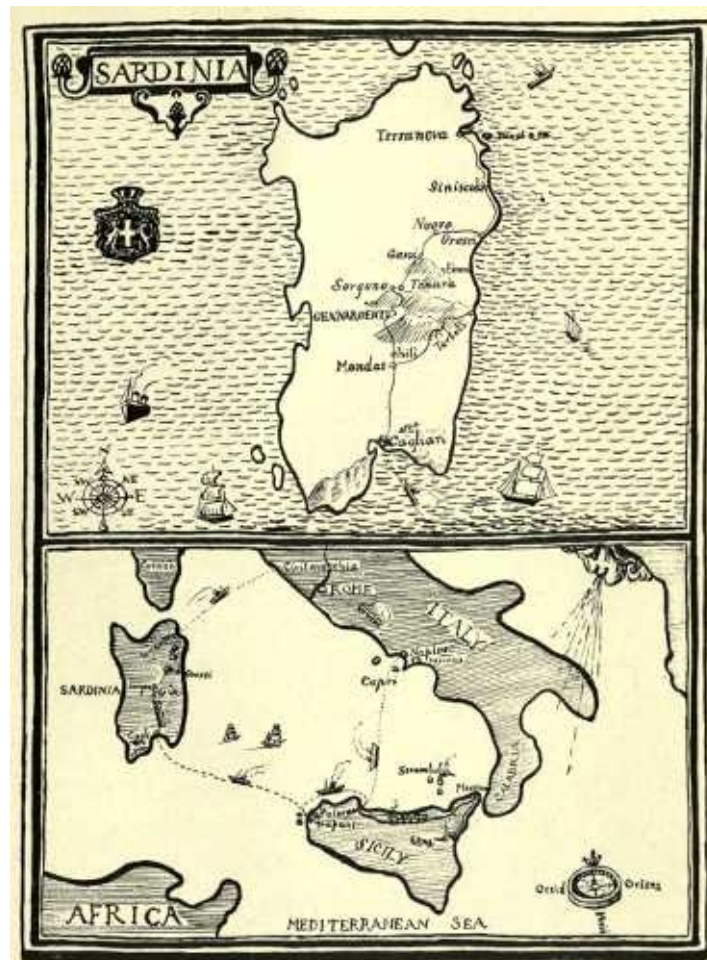
MAP FOR SEA AND SARDINIA

That pale, bluish, theatrical light outside, of the first dawn. And a cold wind. We come on to the wide, desolate quay, the curve of the harbour Panormus. That horrible dawn-pallor of a cold sea out there. And here, port mud, greasy: and fish: and refuse. The American girl is with us, wrapped in her sweater. A coarse, cold, black-slimy world, she seems as if she would melt away before it. But these frail creatures, what a lot they can go through!