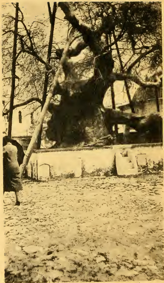
COS, THE PLANE TREE, REPRODUCED FROM A PHOTOGRAPH TAKEN BY MISS M. HENRY