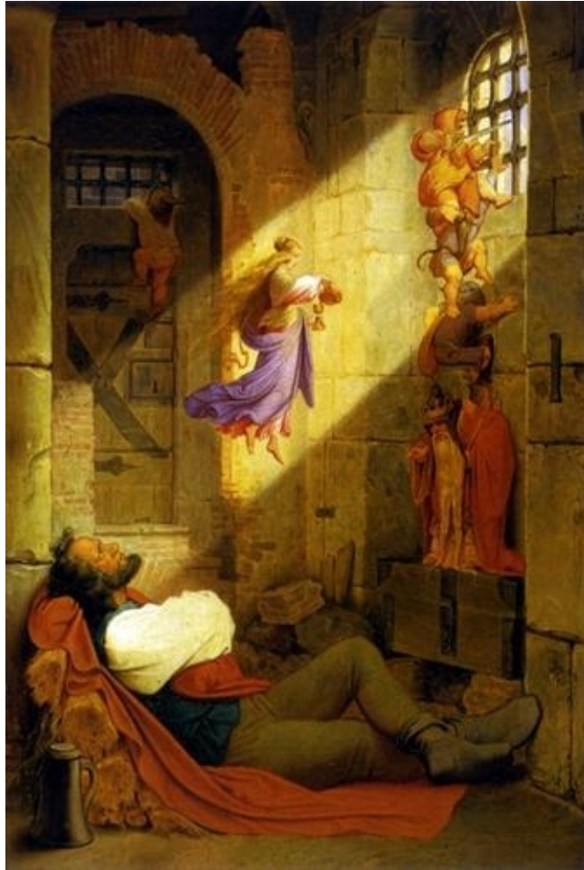
SCHWIND, The Dream of the Prisoner See page 109 for analysis