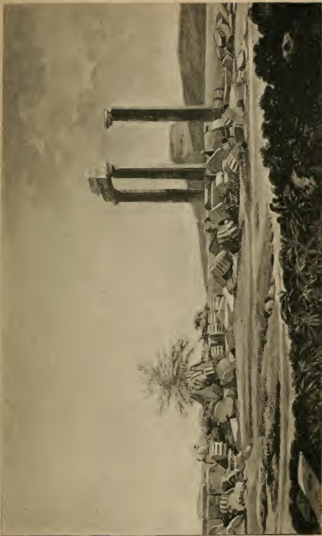
The Temple of Jupiter, Nemea between Argo and Corinth