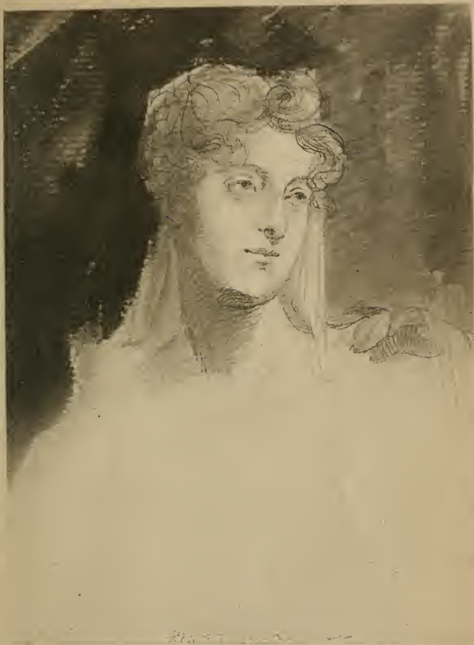
The Hon. Augusta Leigh from a drawing by Sir George Hayter.