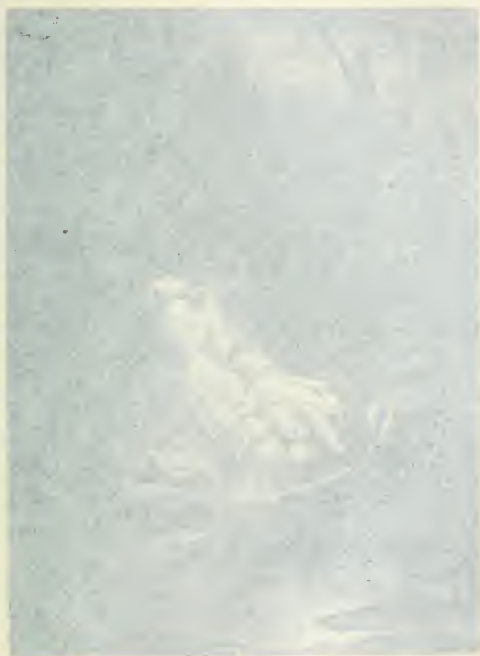
— Seagull on the beach — — Seagull on the beach —