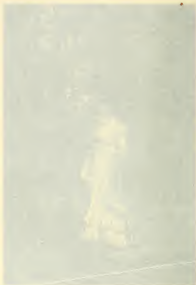
Photograph of a soldier in uniform, standing in a field, possibly a soldier in uniform, with a dark background.