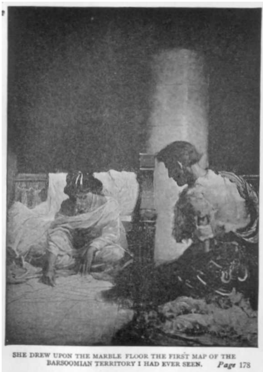
SHE DREW UPON THE MARBLE FLOOR THE FIRST MAP OF THE BARSOOMIAN TERRITORY I HAD EVER SEEN. Page 178

She drew upon the marble floor the first map of the Barsoomian territory I had ever seen.