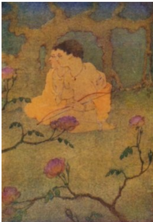
[from a drawing by Surendranath Ganguli]

He longed to be the wind and blow through your rustling branches, to be your shadow and lengthen with the day on the water, to be a bird and perch on your top-most twig, and to float like those ducks among the weeds and shadows.