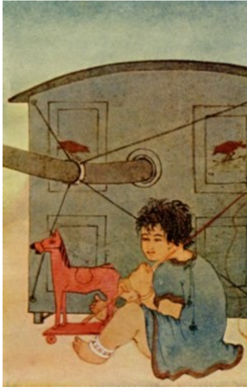
[from a drawing by Nandalal Bose]