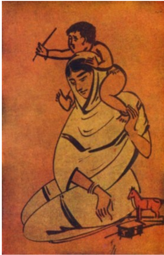
[The Home - from a drawing by Nandalall Bose]