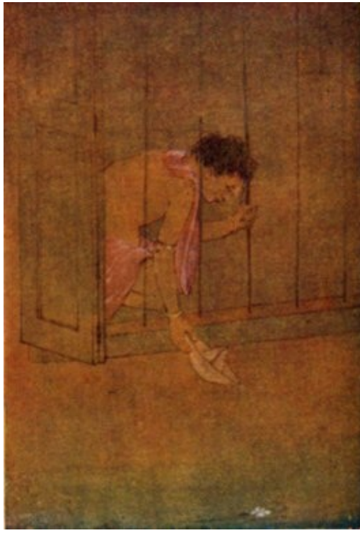
[from a drawing by Surendranath Ganguli]