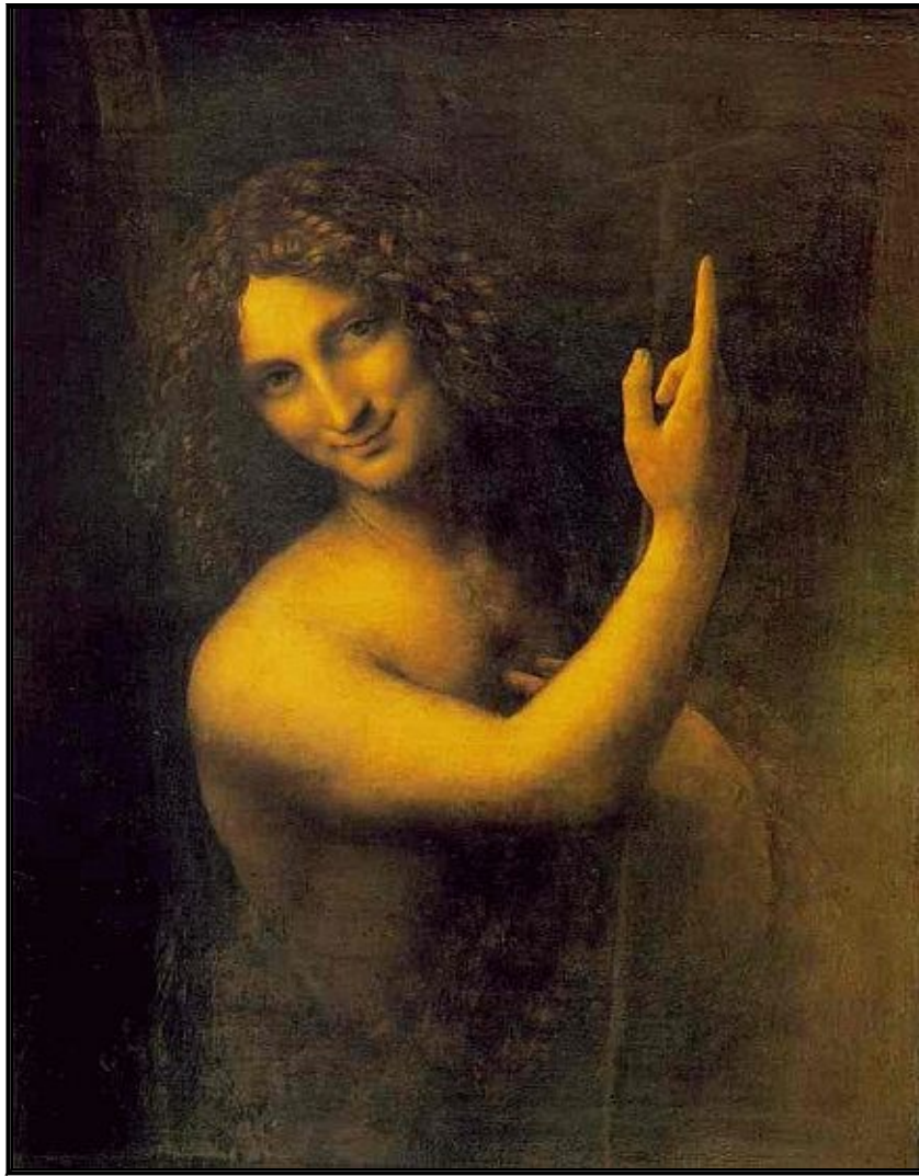
JOHN THE BAPTIST