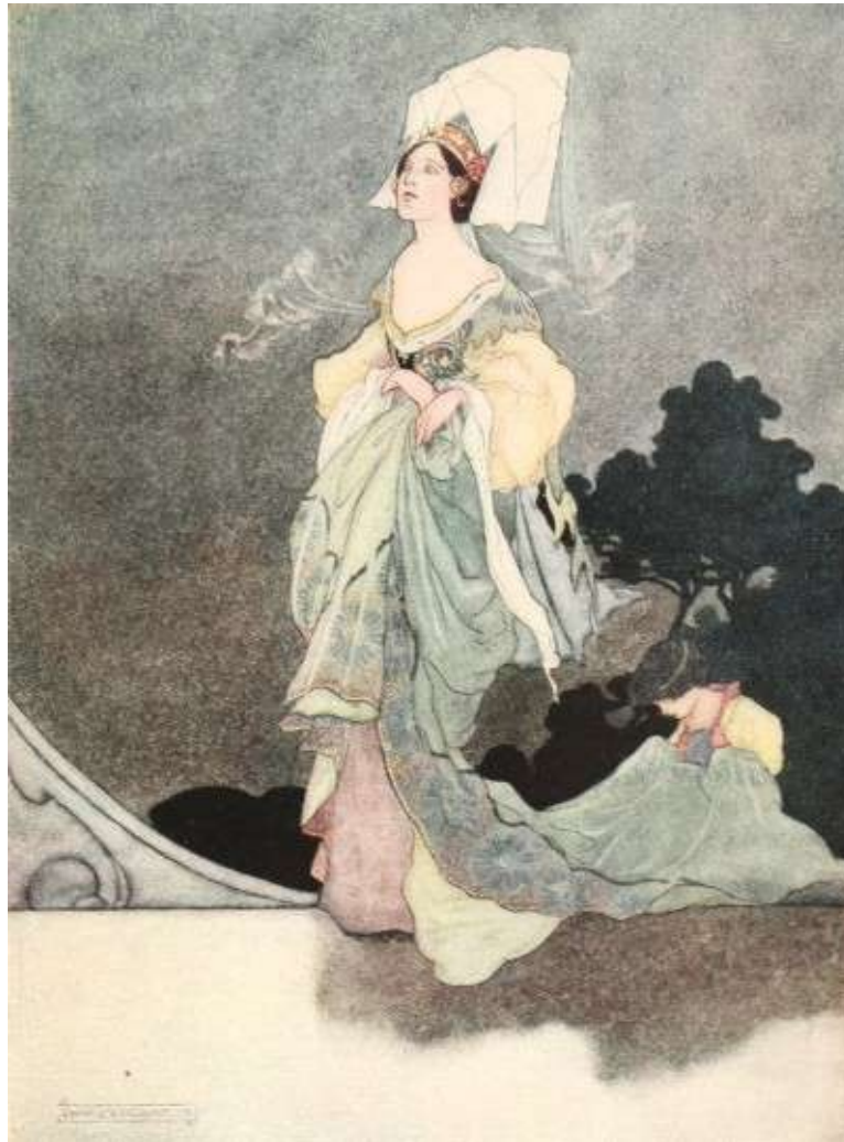
THE LOVELIEST OF THE QUEEN'S MAIDS OF HONOUR

“Swallow, Swallow, little Swallow,” said the Prince, “will you not stay with me one night longer?”