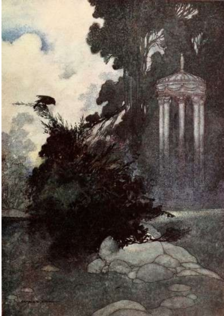
THE GREEN LINNET

and every day he worked in his garden. In all the country-side there was no garden so lovely as his. Sweet-william grew there, and Gilly-flowers, and Shepherds'-purses, and Fair-maids of France. There were damask Roses, and yellow Roses, lilac Crocuses and gold, purple Violets and white. Columbine and Ladysmock, Marjoram and Wild Basil, the Cowslip and the Flower-de-luce, the Daffodil and the Clove-Pink bloomed or blossomed in their proper order as the months went by, one flower taking another flower's place, so that there were always beautiful things to look at, and pleasant odours to smell.