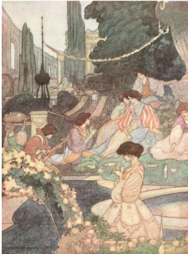
THE PALACE OF SANS-SOUCI

“When I was alive and had a human heart,” answered the statue, “I did not know what tears were, for I lived in the Palace of Sans-Souci, where sorrow is not allowed to enter. In the daytime I played with my companions in the garden, and in the evening I led the dance in the Great Hall. Round the garden ran a very lofty wall, but I never cared to ask what lay beyond it, everything about me was so beautiful. My courtiers called me the Happy Prince, and happy indeed I was, if pleasure be happiness. So I lived, and so I died. And now that I am dead they have set me up here so high that I can see all the ugliness and all the misery of my city, and though my heart is made of lead yet I cannot choose but weep.”