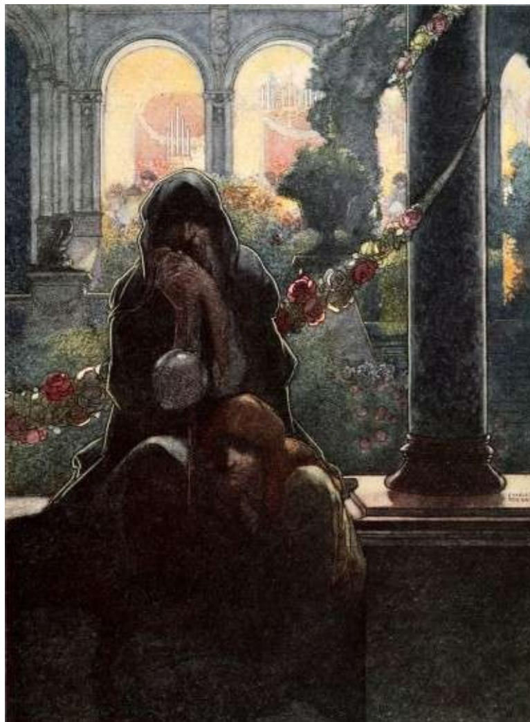
THE RICH MAKING MERRY IN THEIR BEAUTIFUL HOUSES, WHILE THE BEGGARS WERE SITTING AT THE GATES

“Dear little Swallow,” said the Prince, “you tell me of marvellous things, but more marvellous than anything is the suffering of men and of women. There is no Mystery so great as Misery. Fly over my city, little Swallow, and tell me what you see there.”