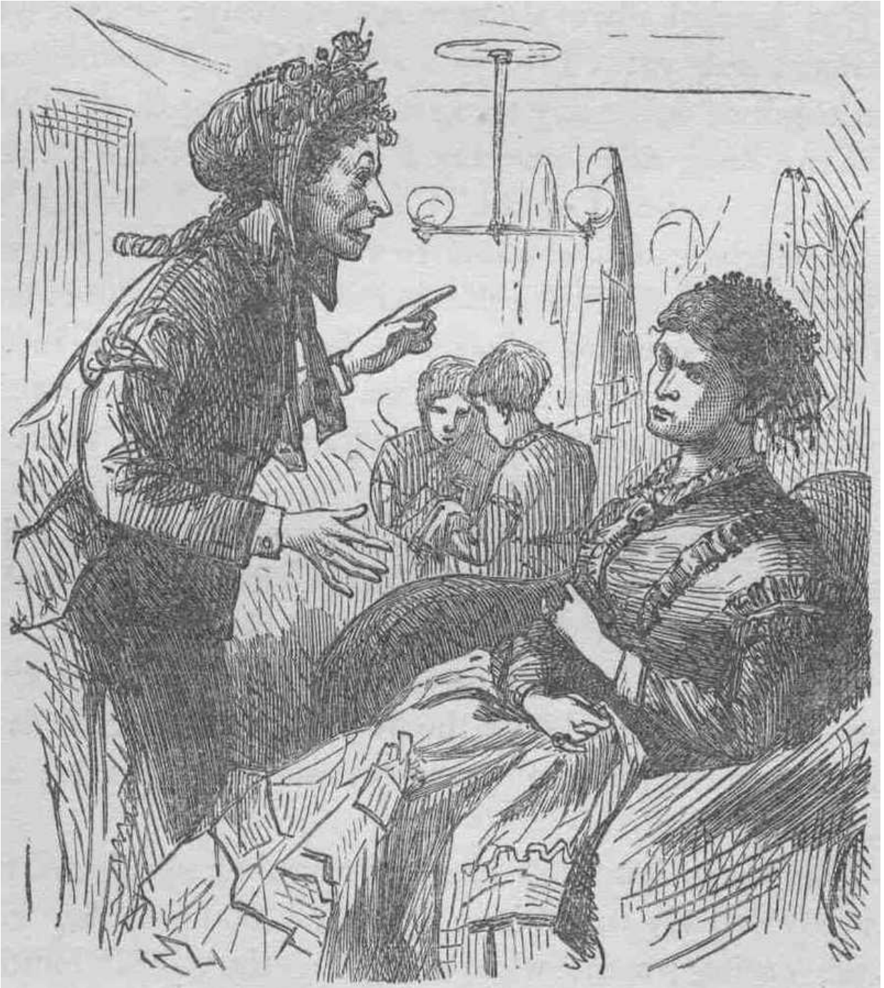
MRS. KING AND MISS COTTON.

Rachel shivered, as if the sound of that familiar voice was a fresh wound, but she did not lift her head; and Mrs. King answered, with a nervous emphasis that made the bugles of her head-dress rattle dismally: