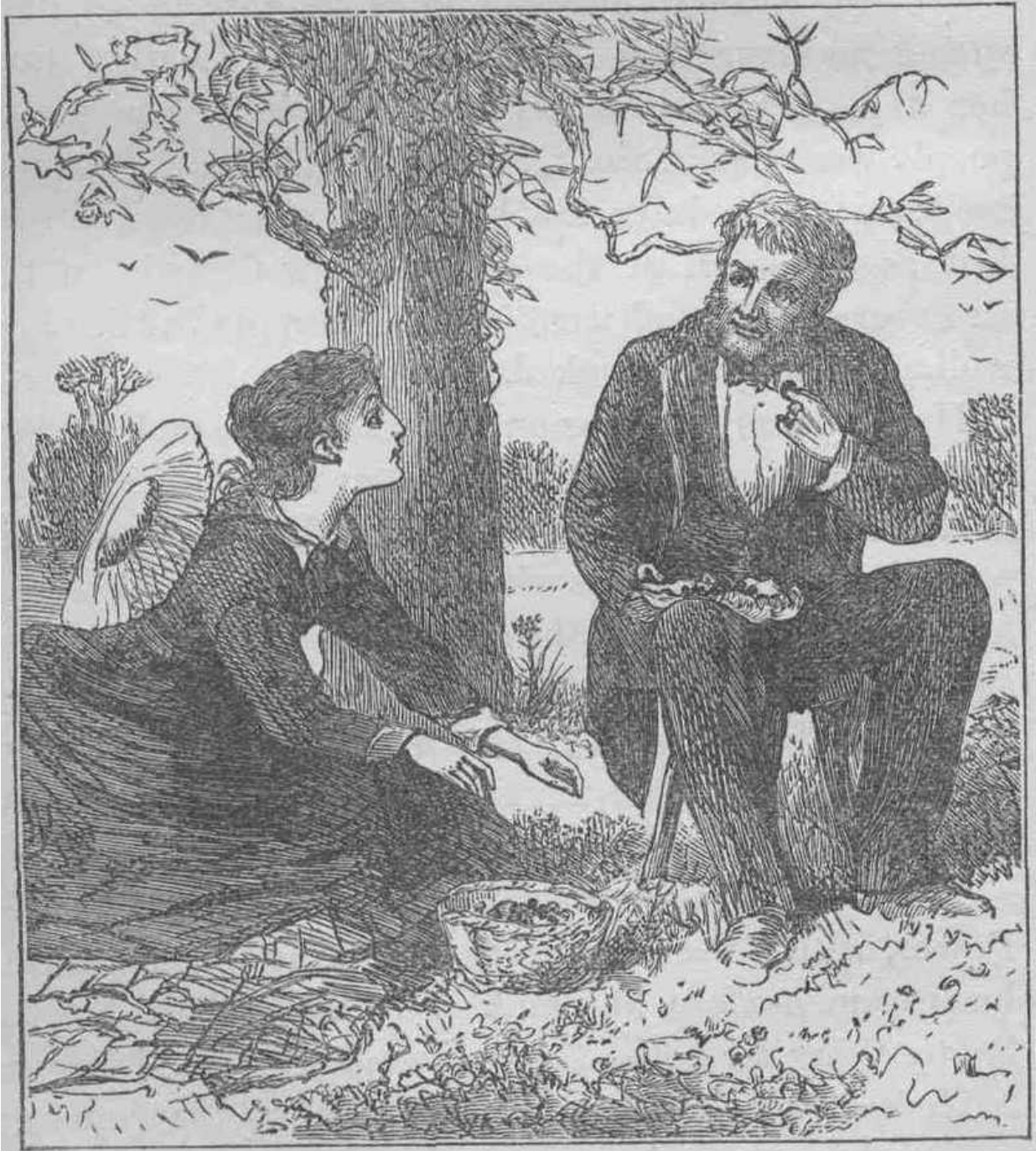
MR. POWER AND CHRISTIE IN THE STRAWBERRY BED.

"Well, and how goes it? Are we still happy and contented here?" he asked.