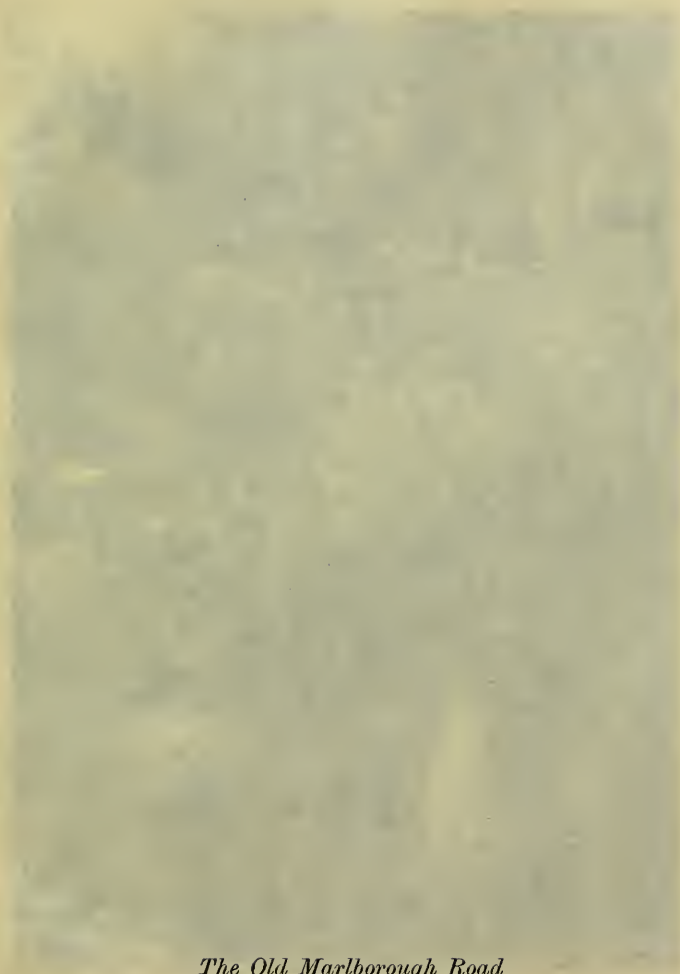
The Old Marlborough Road